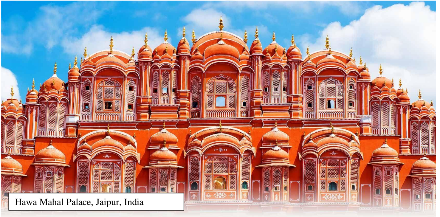
Hawa Mahal Palace, Jaipur, India