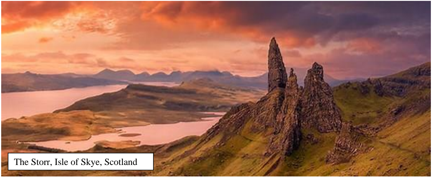
The Storr, Isle of Skye, Scotland