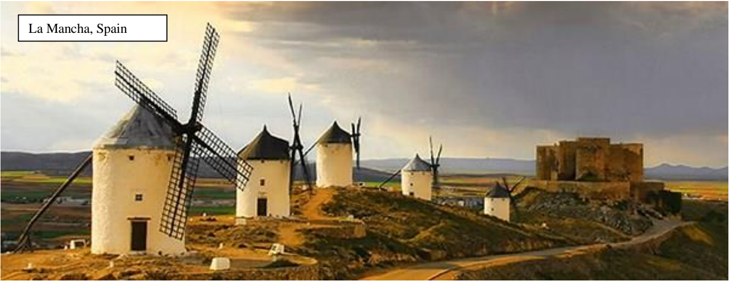
La Mancha, Spain