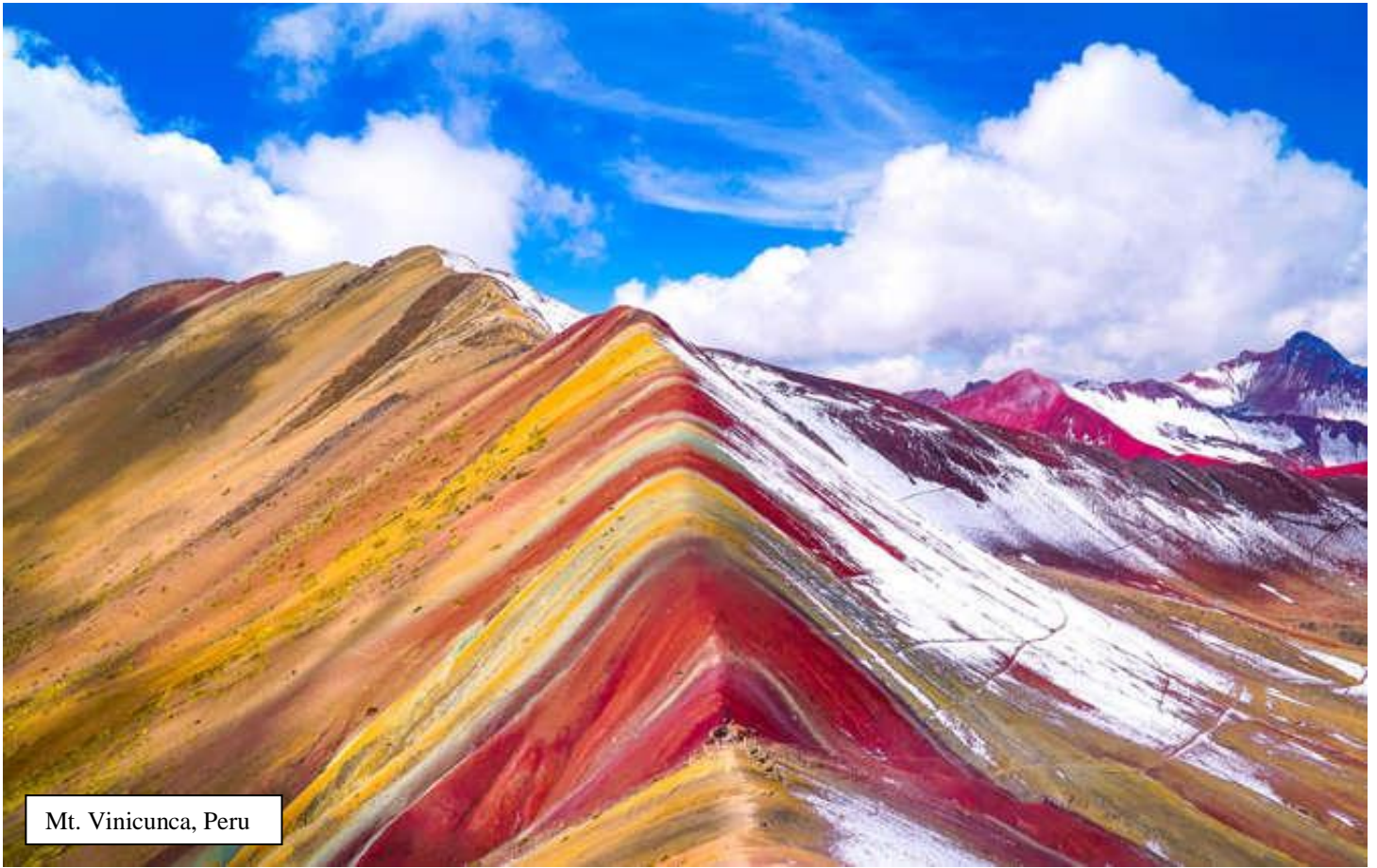
Mt. Vinicunca, Peru