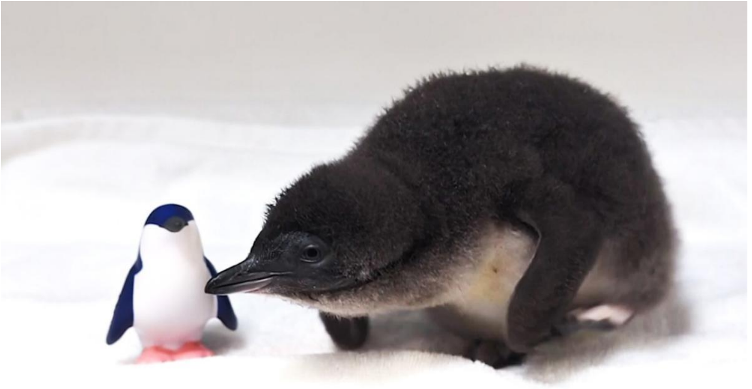
The first blue penguin to hatch at San Diego Zoo, 1 January 2024. ( Baby penguin at right; toy at left. )