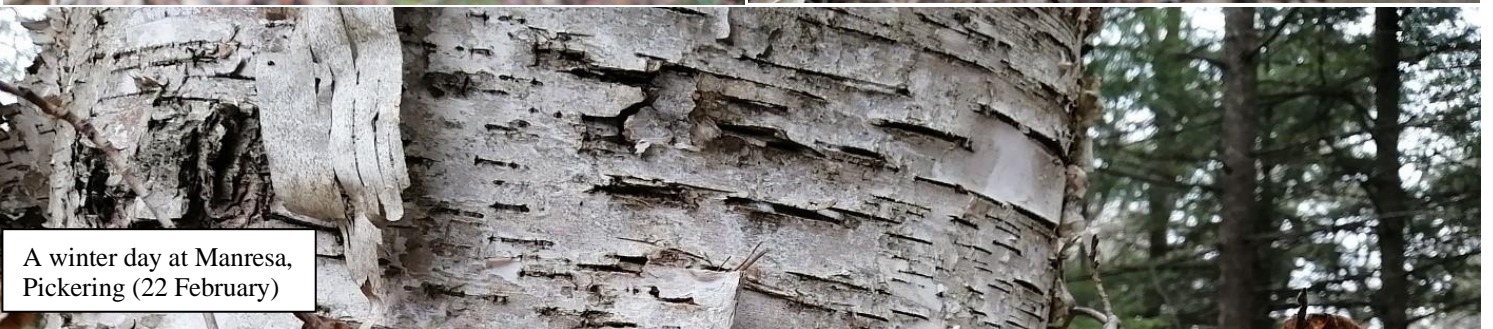
A winter day at Manresa, Pickering (22 February)