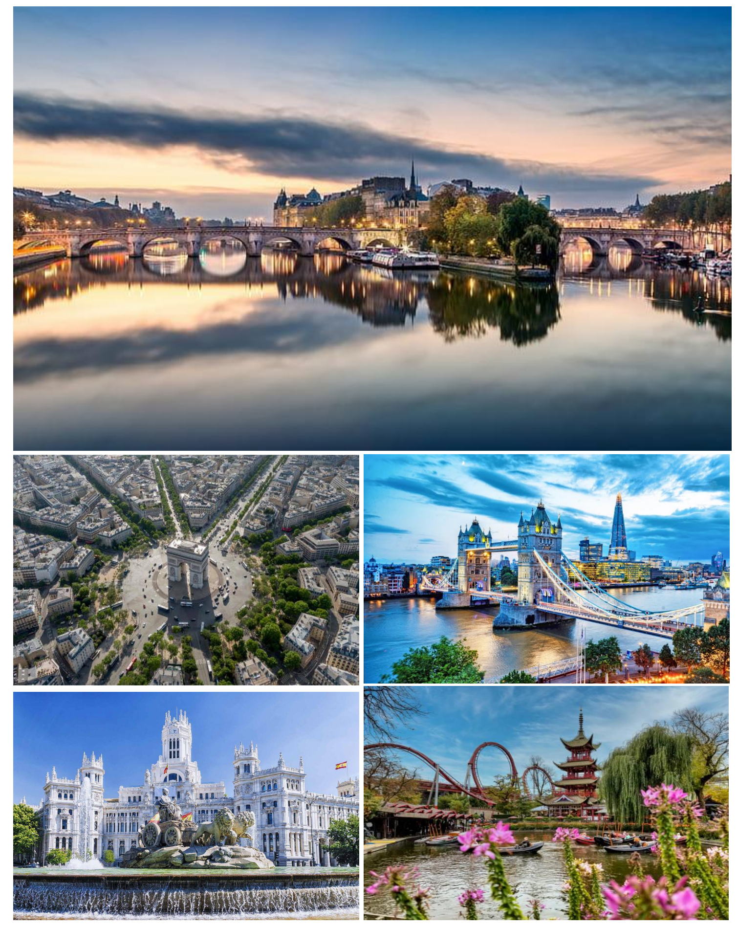
Paris (top, and the Arc de Triomphe in l'Etoile); Madrid.