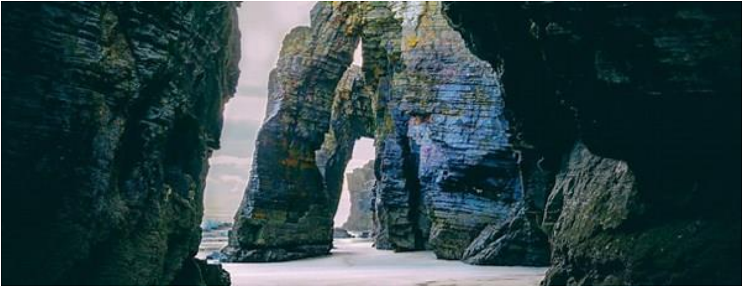
[Above:] As Catedrais, Galcia coast, Spain