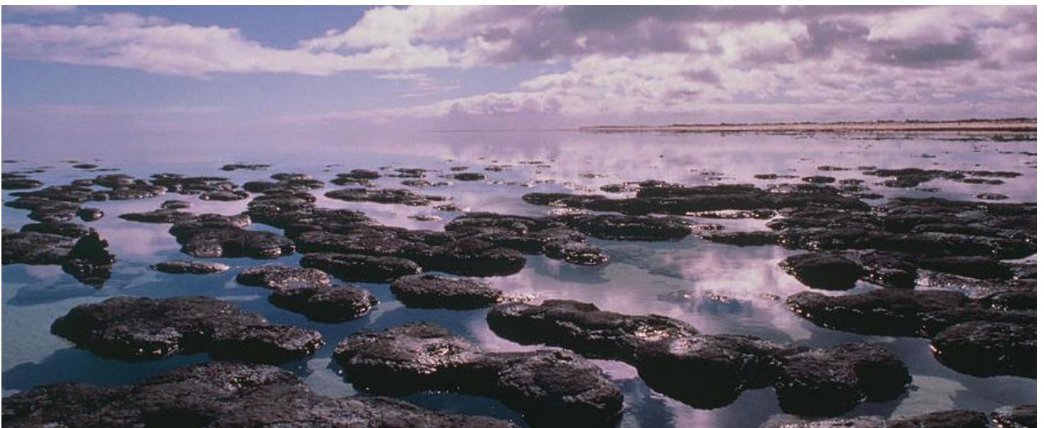
[Below:] Stromatolites, Shark Bay, Australia