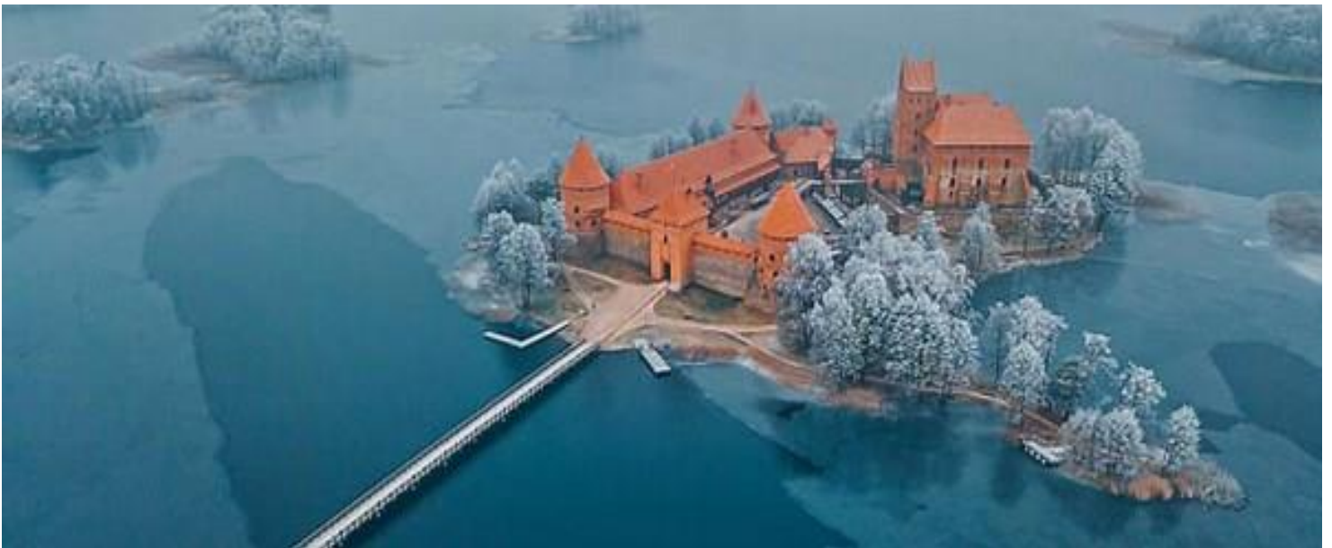
[Above:] Trakai Island, Lithuania