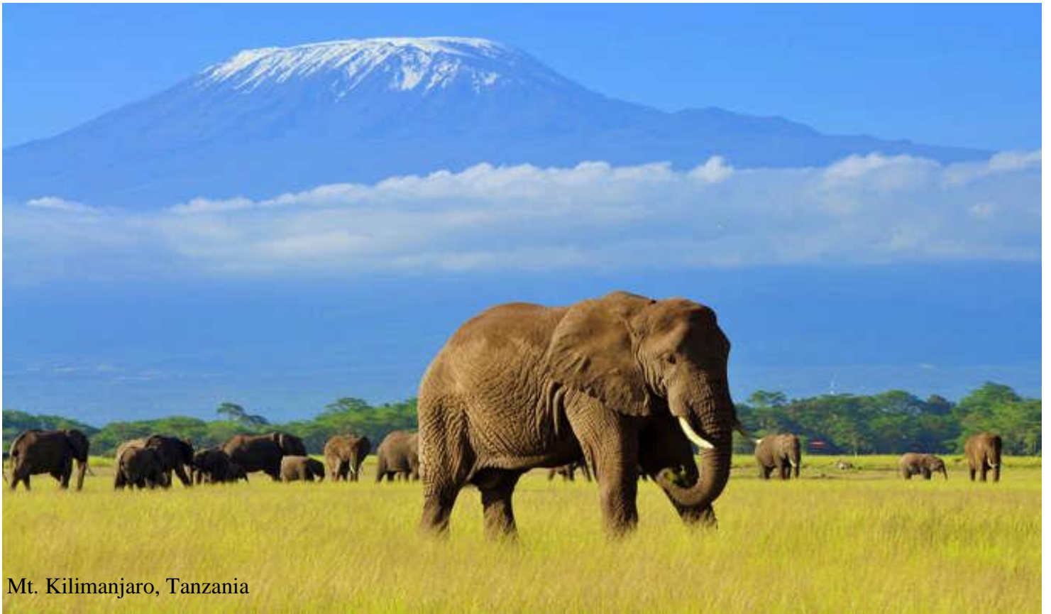
Mt. Kilimanjaro, Tanzania