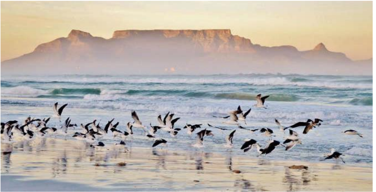
Table Mountain, S. Africa