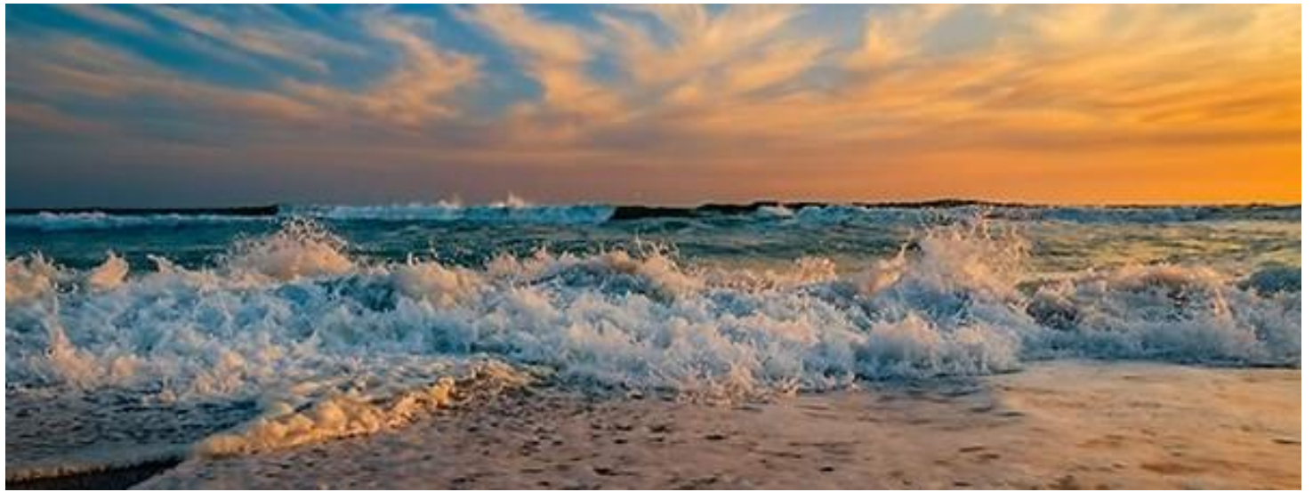
West Coast Park