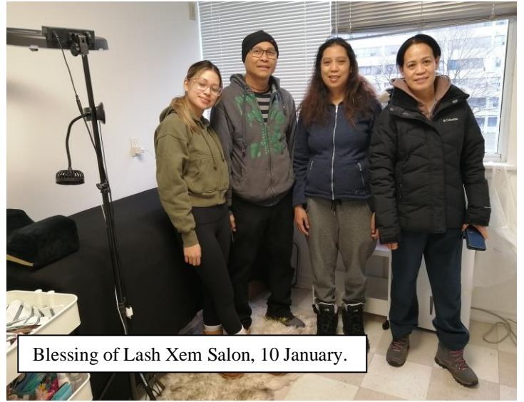
Blessing of Lash Xem Salon, 10 January.