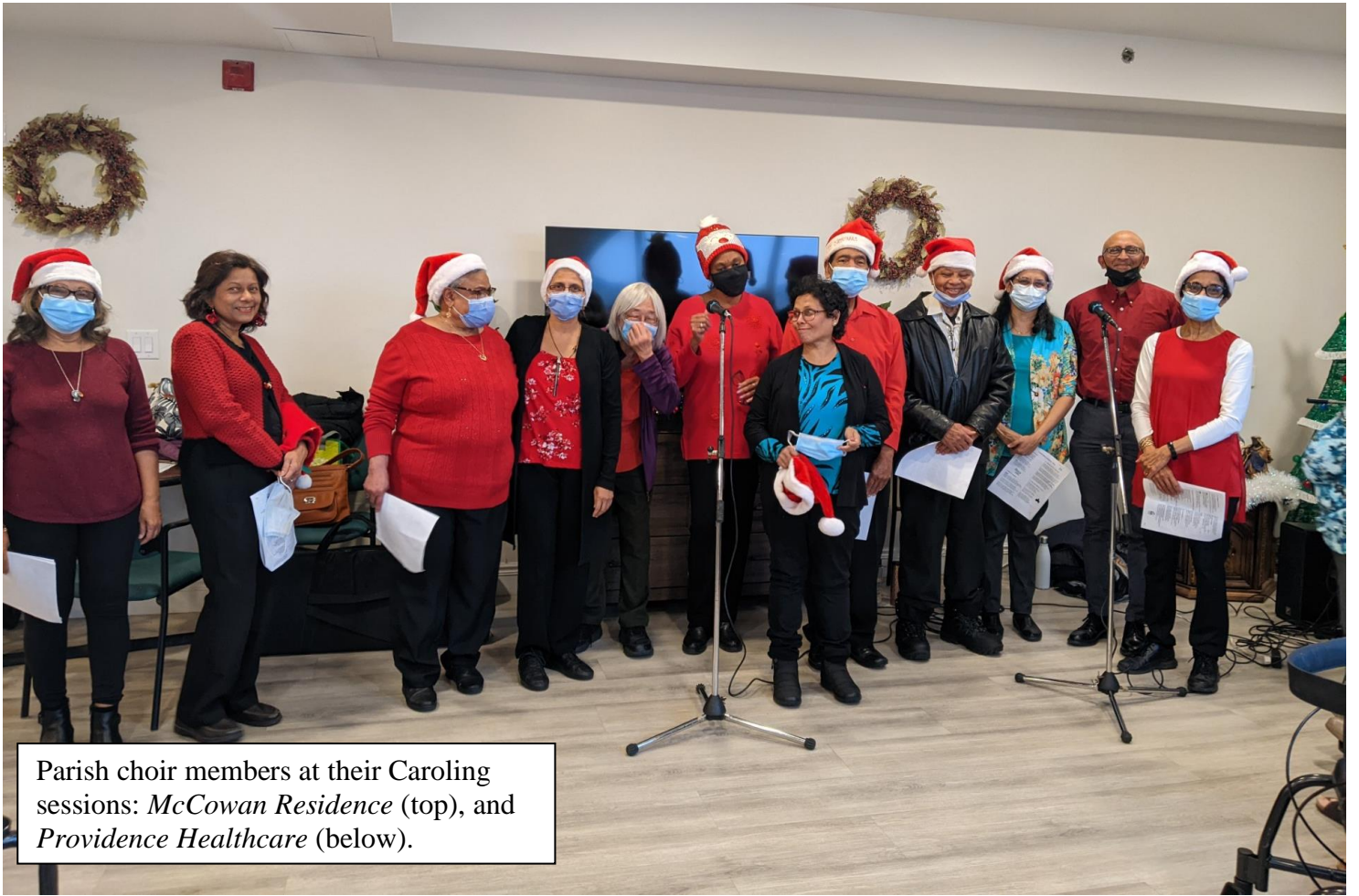
Parish choir members at their Caroling sessions: McCowan Residence (top), and Providence Healthcare (below).