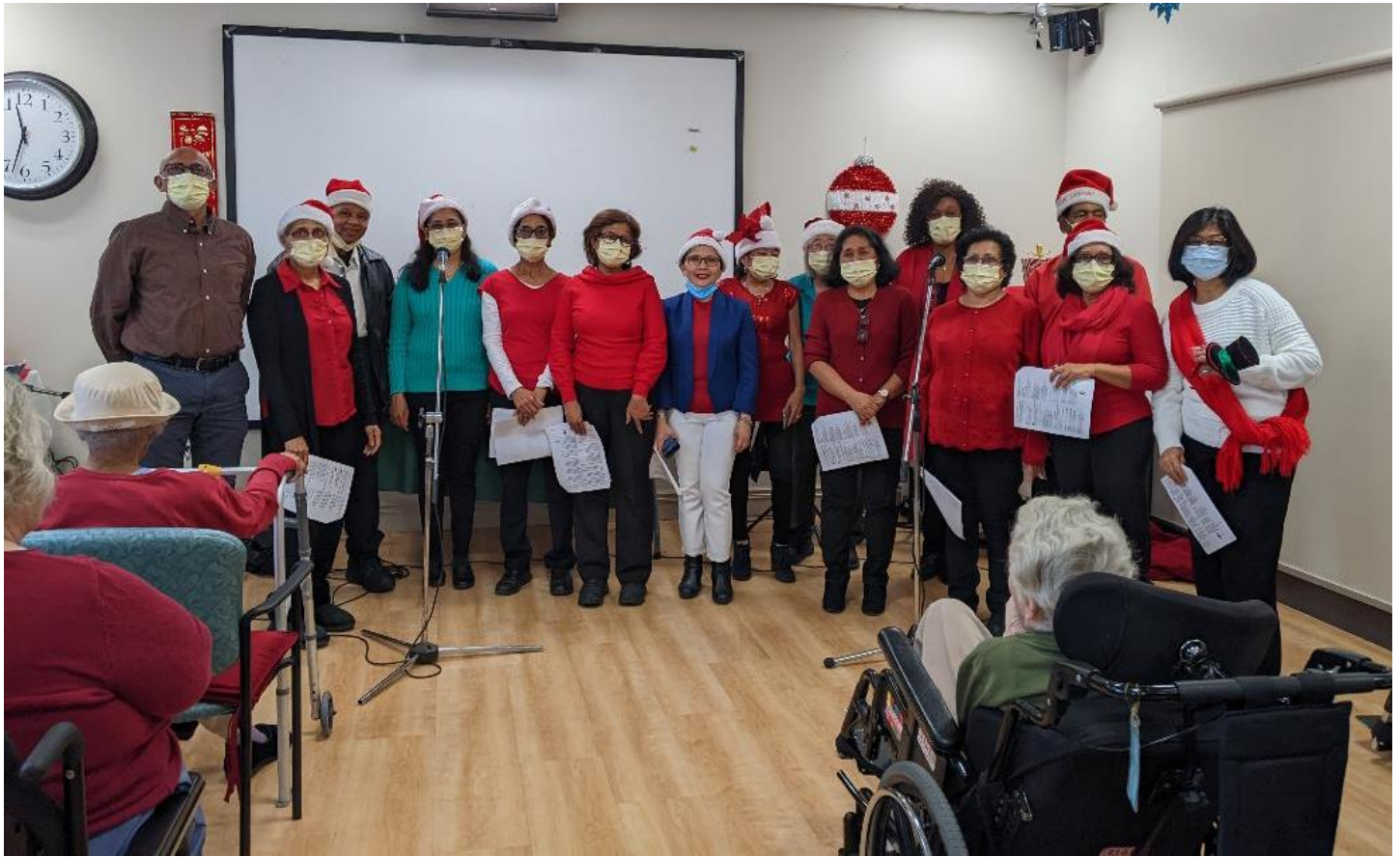
Trilogy Long Term Care, and Scarborough Retirement Home.