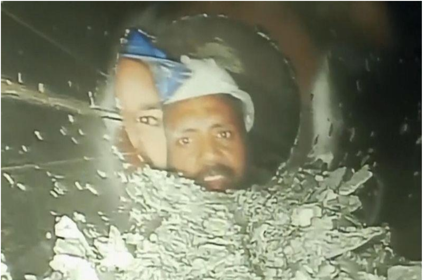
[Below] Trapped Indian tunnel workers finally rescued.