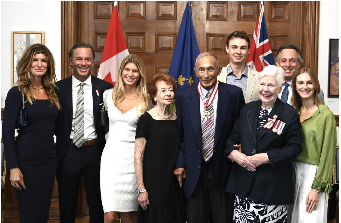
[Above] George Cohon, 19 April 1937 – 24 November 2023.