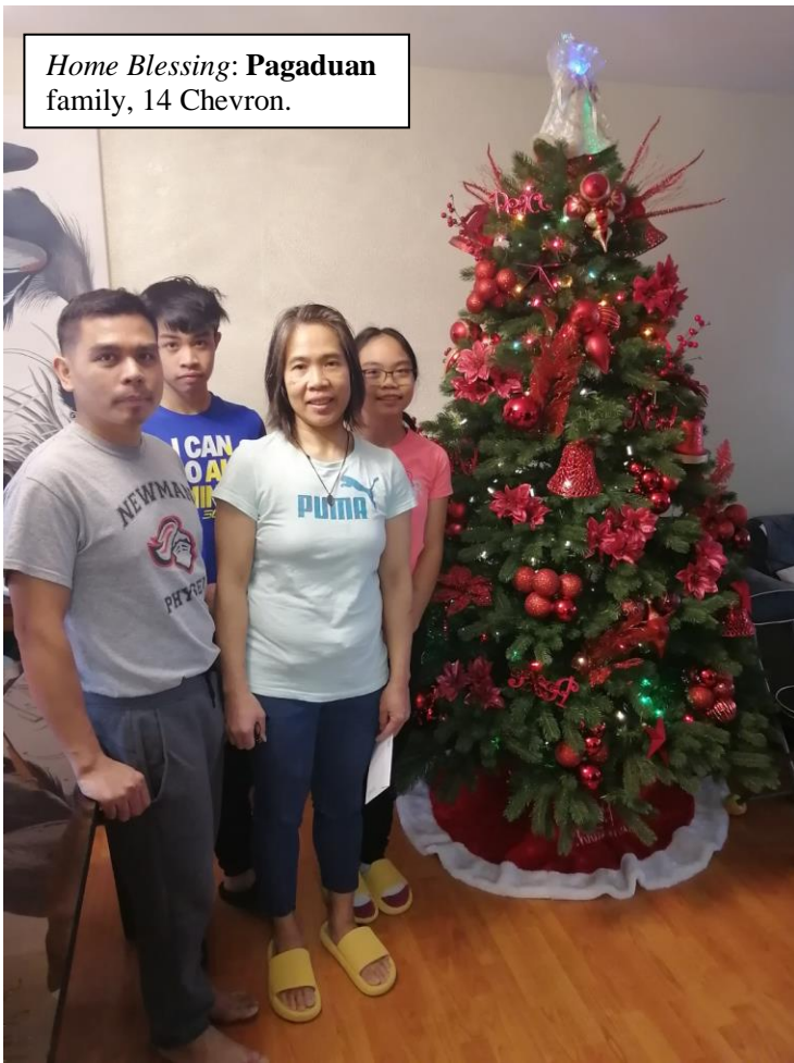
Home Blessing: Pagaduan family, 14 Chevron.