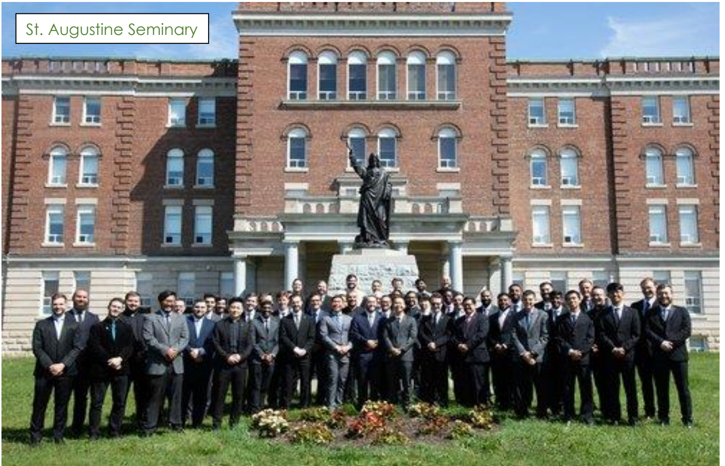
St. Augustine Seminary