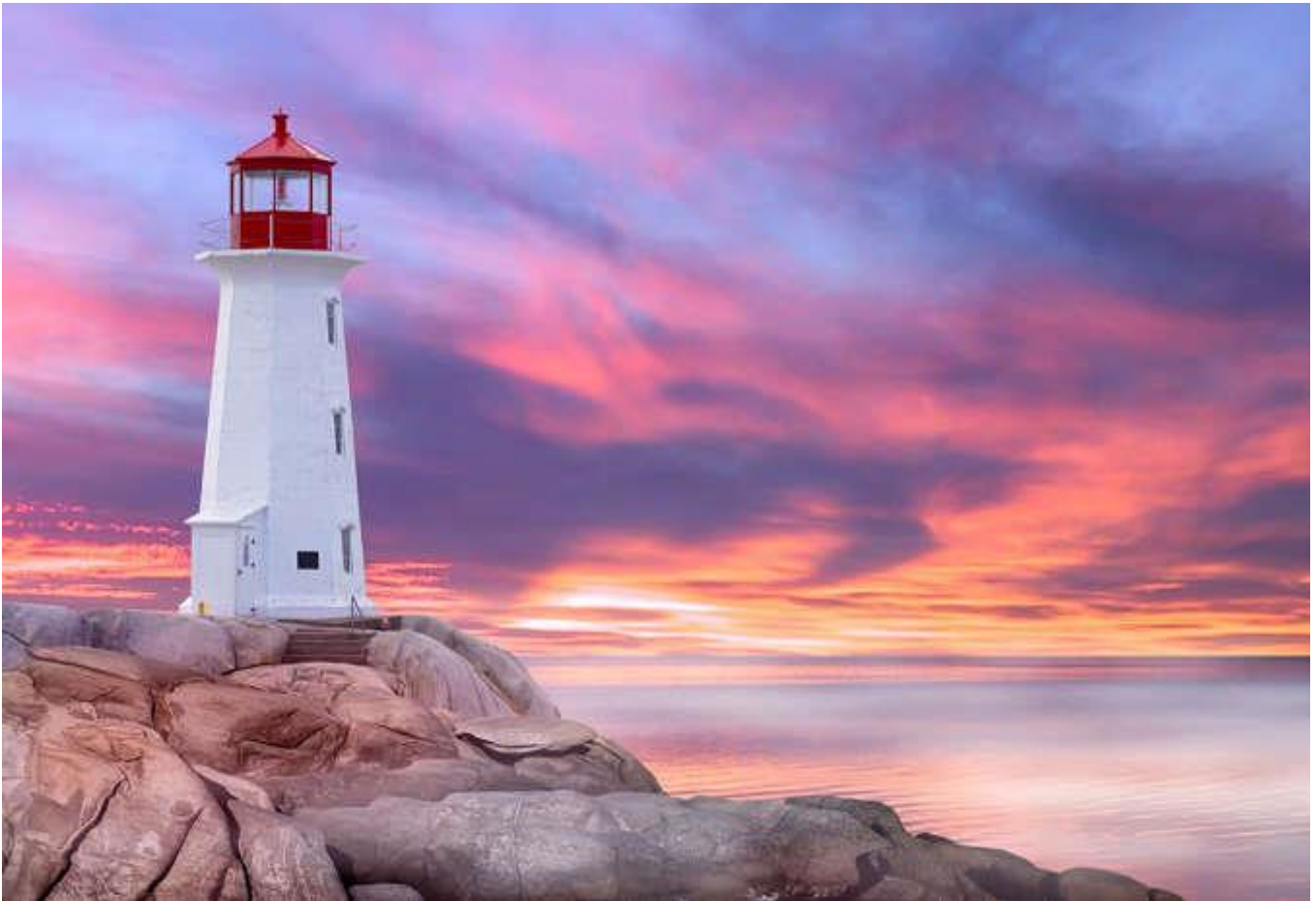
Peggy's Cove, N.S.