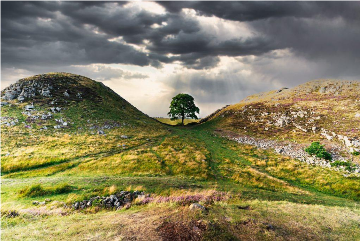
[Above: ] Sycamore Gap, Hadrian's Wall, England.