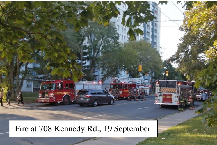
Fire at 708 Kennedy Rd., 19 September