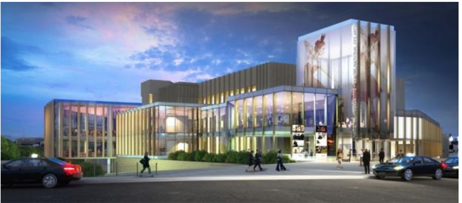
NATIONAL ARTS CENTRE, Ottawa ; Original appearance in 1969 (a.k.a. the “mausoleum,” top), and after renovation, 2019 (above).