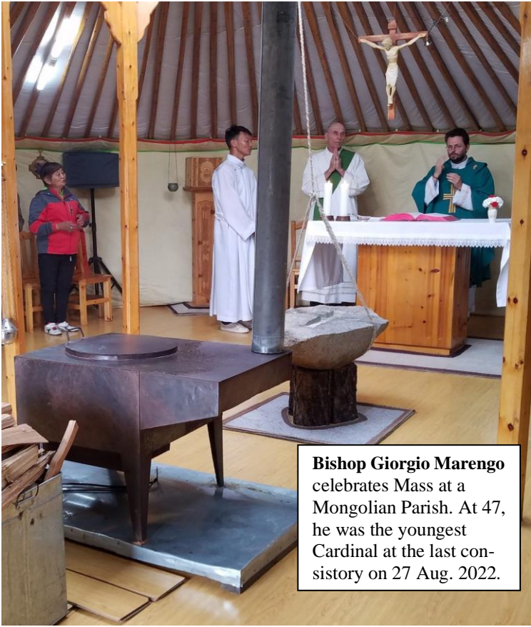
Bishop Giorgio Marengo celebrates Mass at a Mongolian Parish. At 47, he was the youngest Cardinal at the last consistory on 27 Aug. 2022.