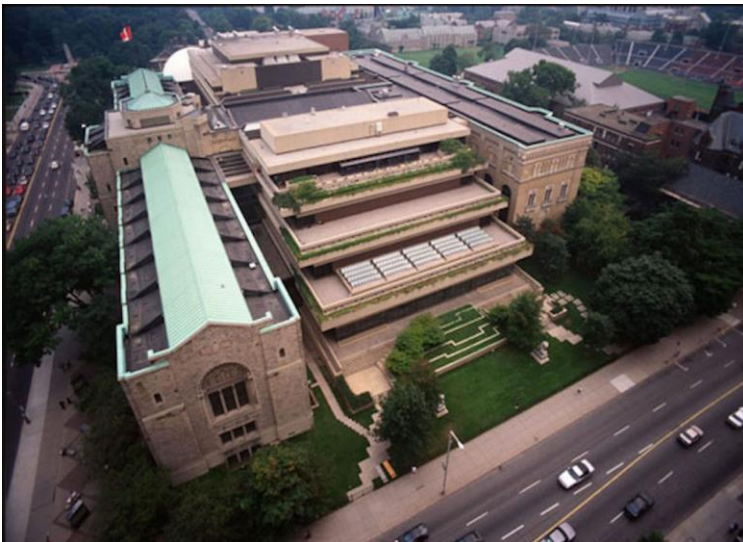
ROYAL ONTARIO MUSEUM, Toronto ; Appearance in 1999 (lower left), and after addition of the ‘Crystal,’ 2009 (lower right).