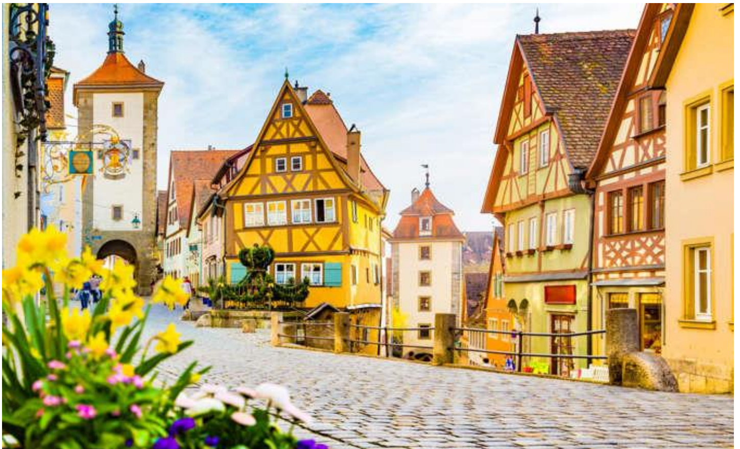
Rothenburg ob der Tauber, Germany