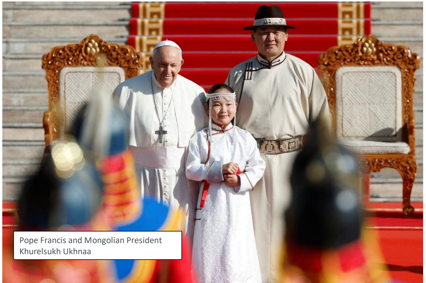
Pope Francis and Mongolian President Khurelsukh Ukhnaa