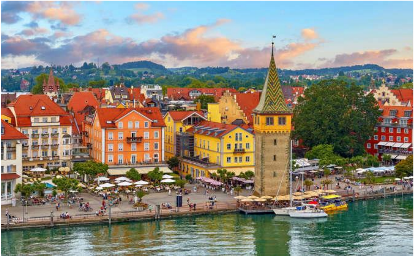
Lindau, on Lake Constance, Germany