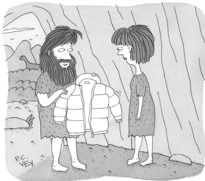
"It's made from one hundred per cent dinosaur-based petroleum products."