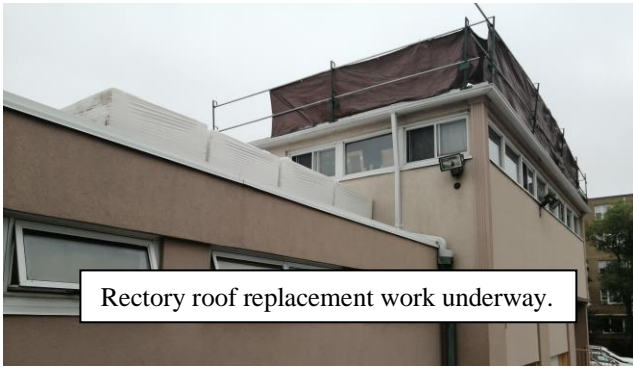
Rectory roof replacement work underway.