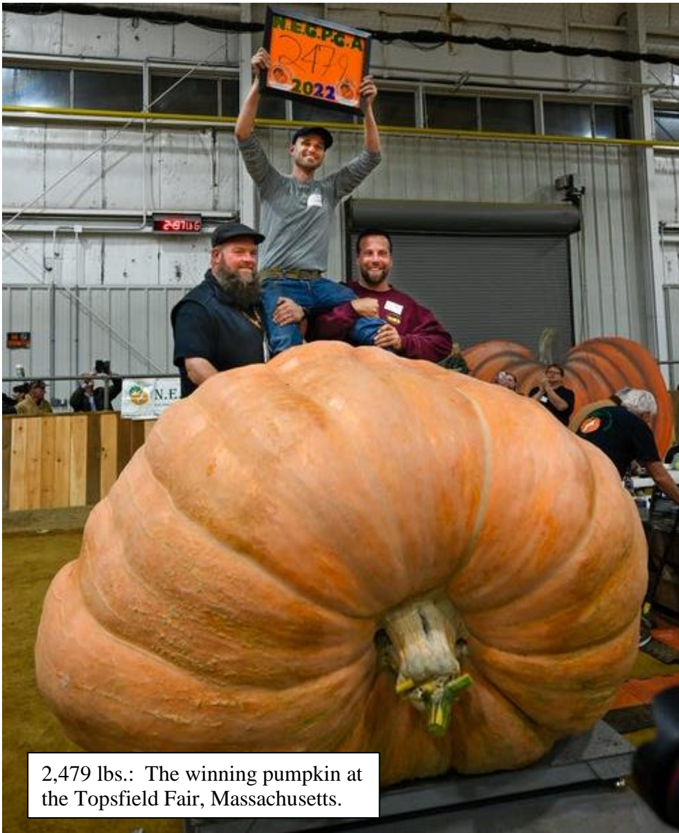
2,479 lbs.: The winning pumpkin at the Topsfield Fair, Massachusetts.