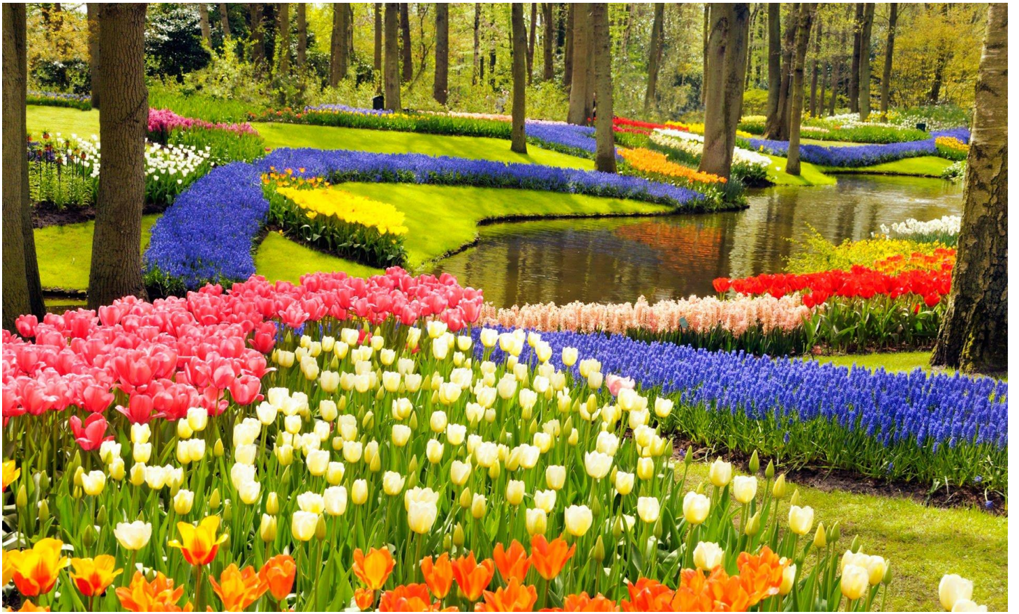
[Above:] Netherlands in the Spring.