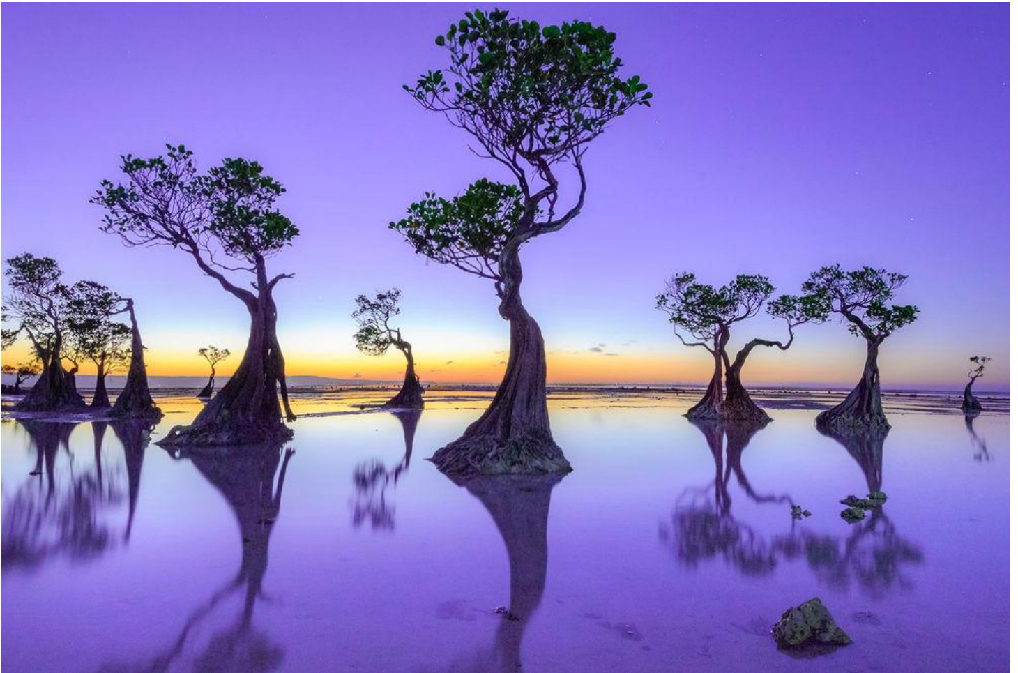
[Below:] Mangrove trees at Walakiri Beach, Indonesia