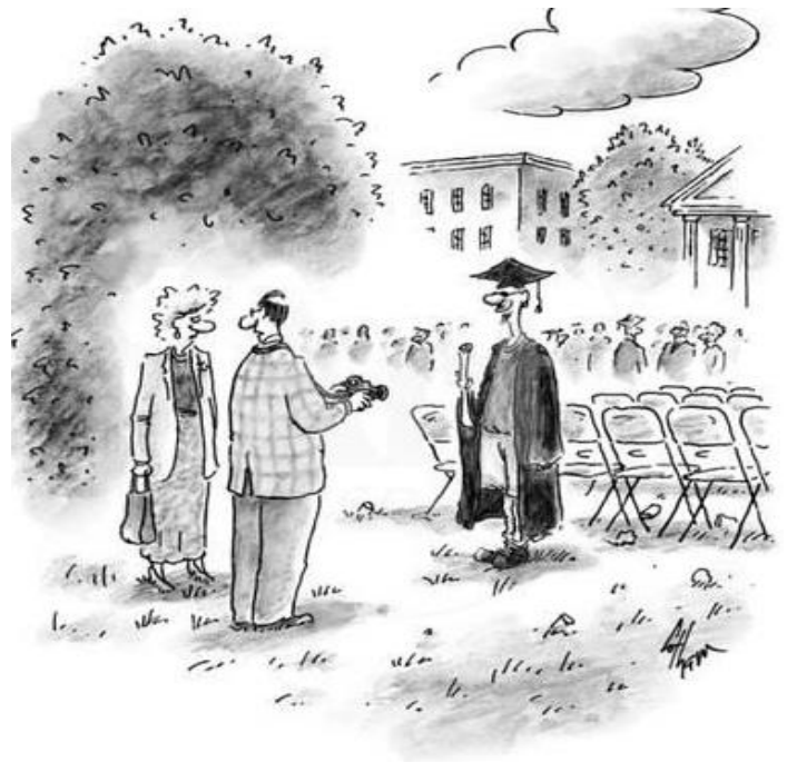
"What does he know, and how long will he know it?"