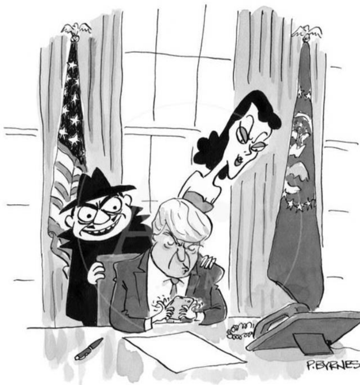
"Tell them is fake news, work of moose and squirrel."