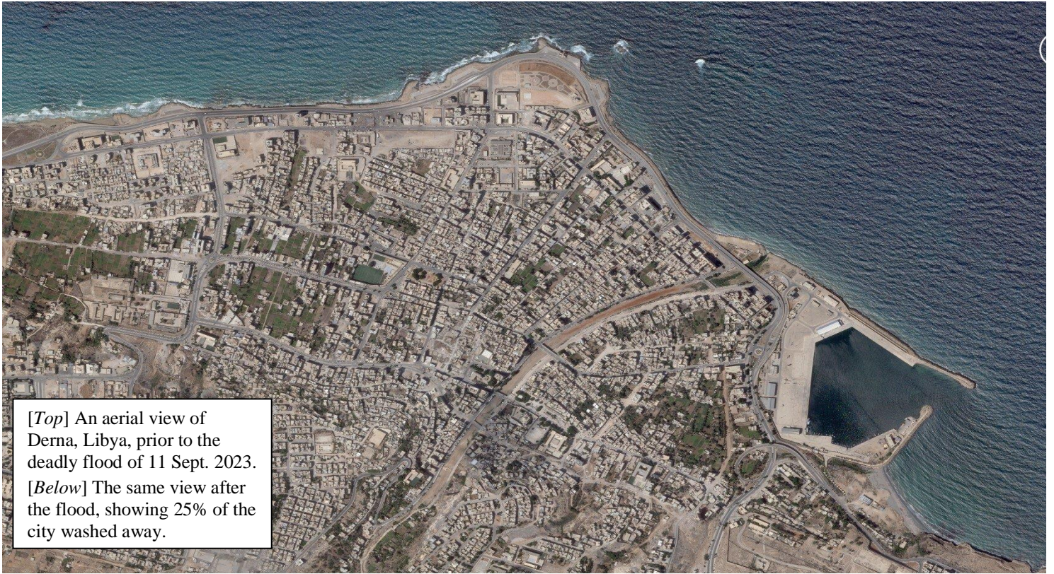
[Top] An aerial view of Derna, Libya, prior to the deadly flood of 11 Sept. 2023. [Below] The same view after the flood, showing 25% of the city washed away.