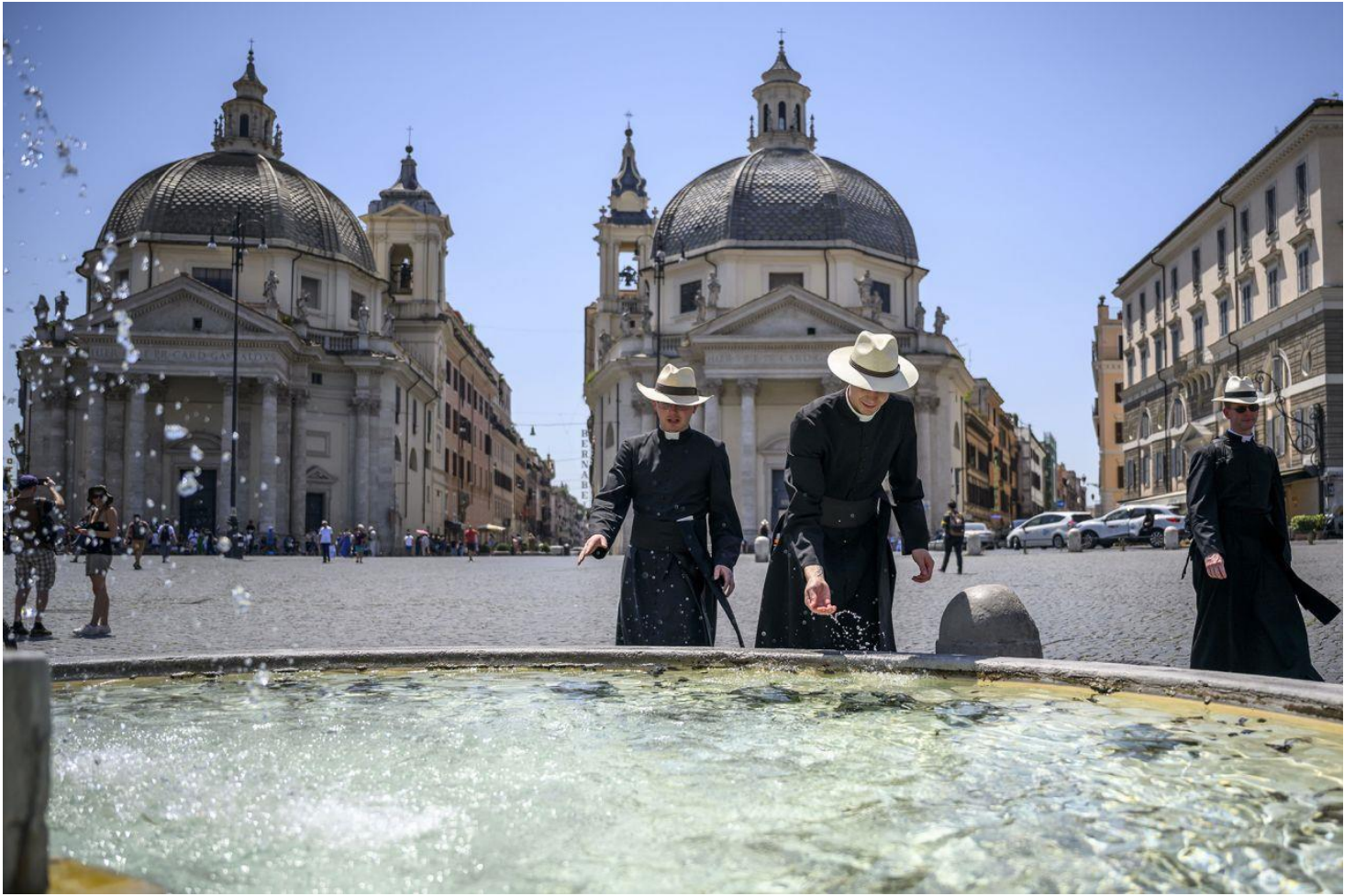
Above: Piazza Del Popolo, Rome