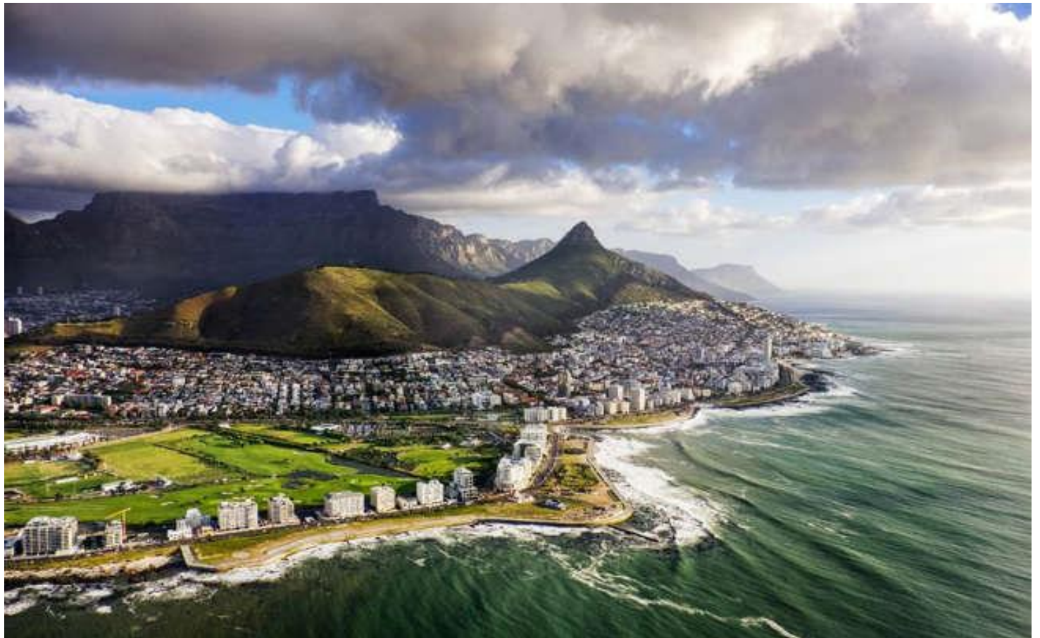
Below: Cape Town