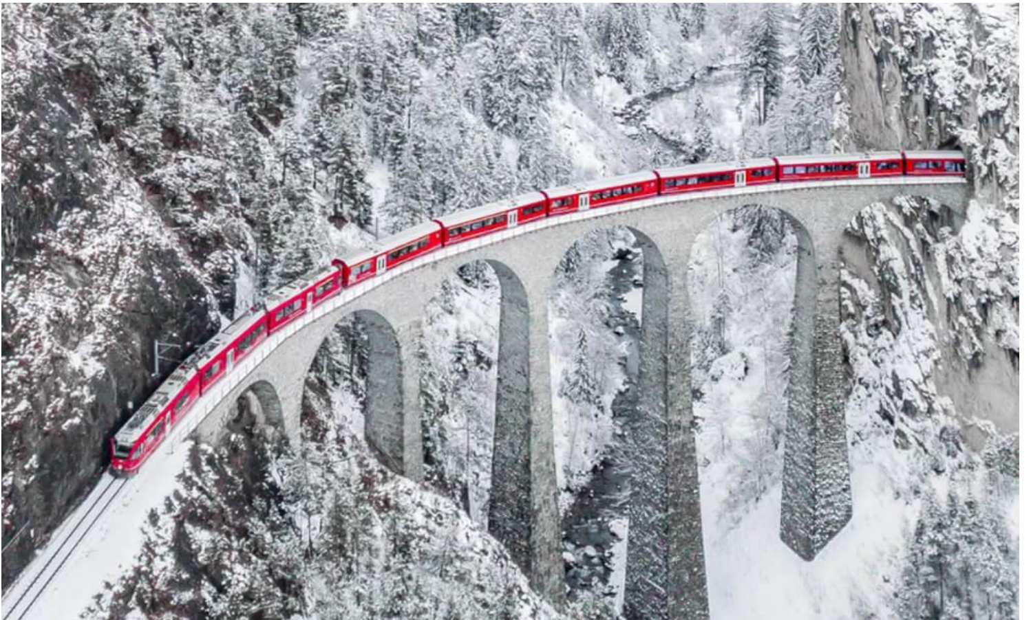
Below: Swiss Rail