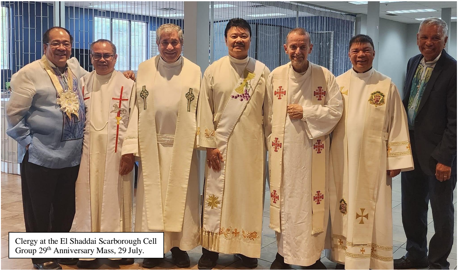
Clergy at the El Shaddai Scarborough Cell Group 29 th Anniversary Mass, 29 July.