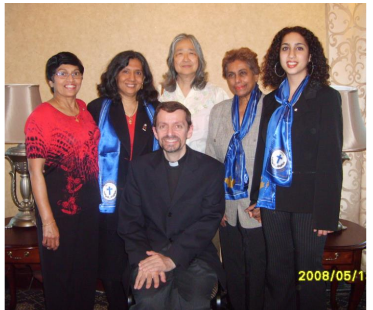
CWL Convention, 15 May 2008

"The secret of happiness is to live moment by moment and to thank God for all that He, in His goodness, sends to us day after day."