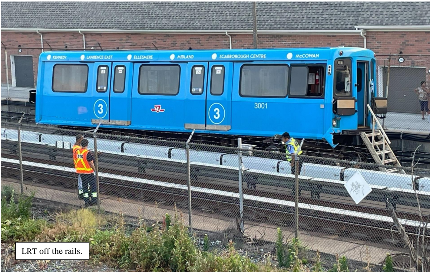
LRT off the rails.