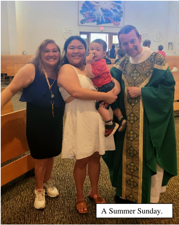
A Summer Sunday.