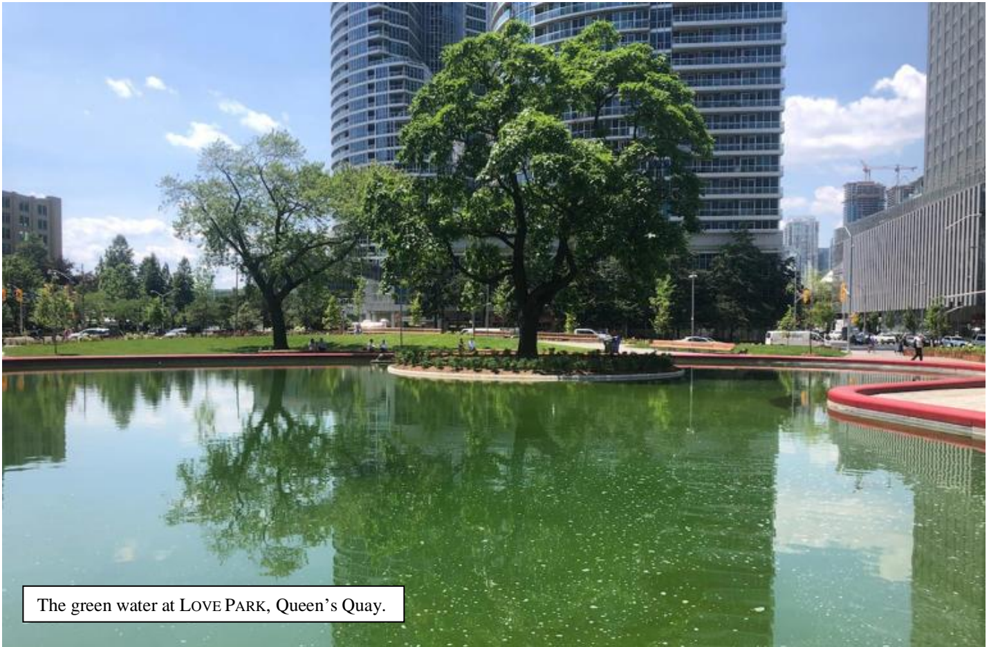
The green water at LOVE PARK, Queen's Quay.