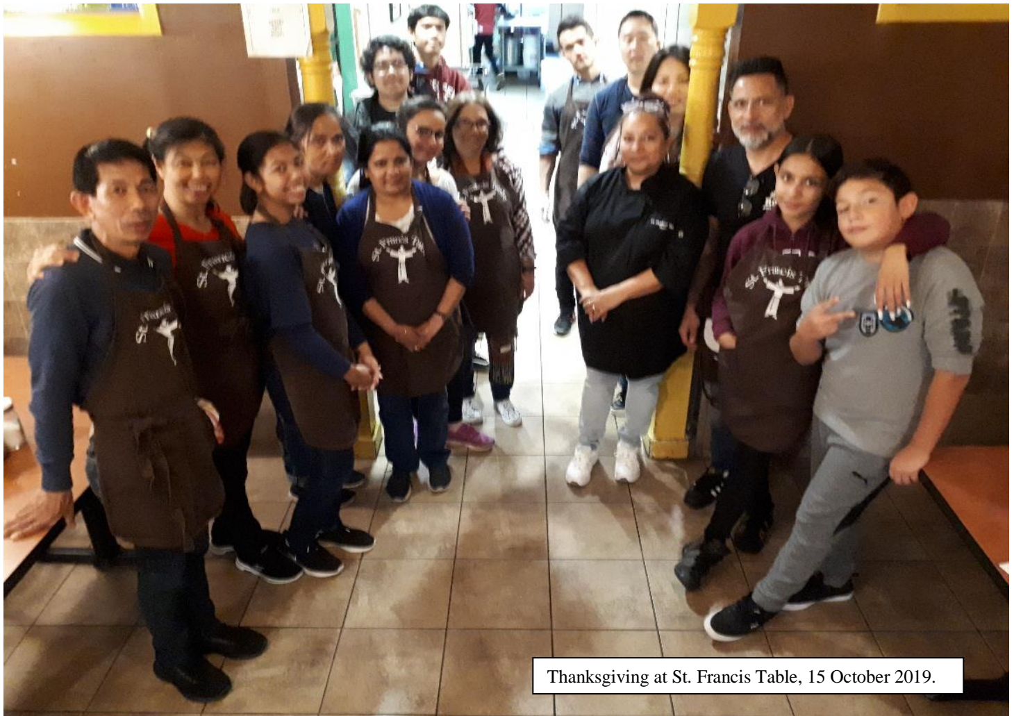
Thanksgiving at St. Francis Table, 15 October 2019.