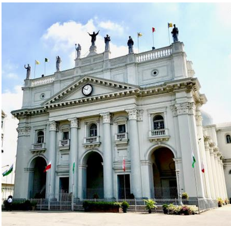
St. Lucia Cathedral, Colombo