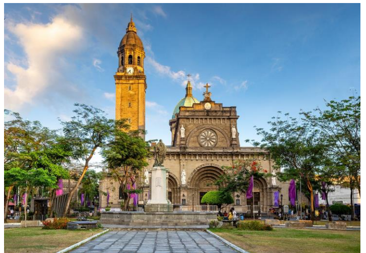
Immaculate Conception Cathedral, Manila