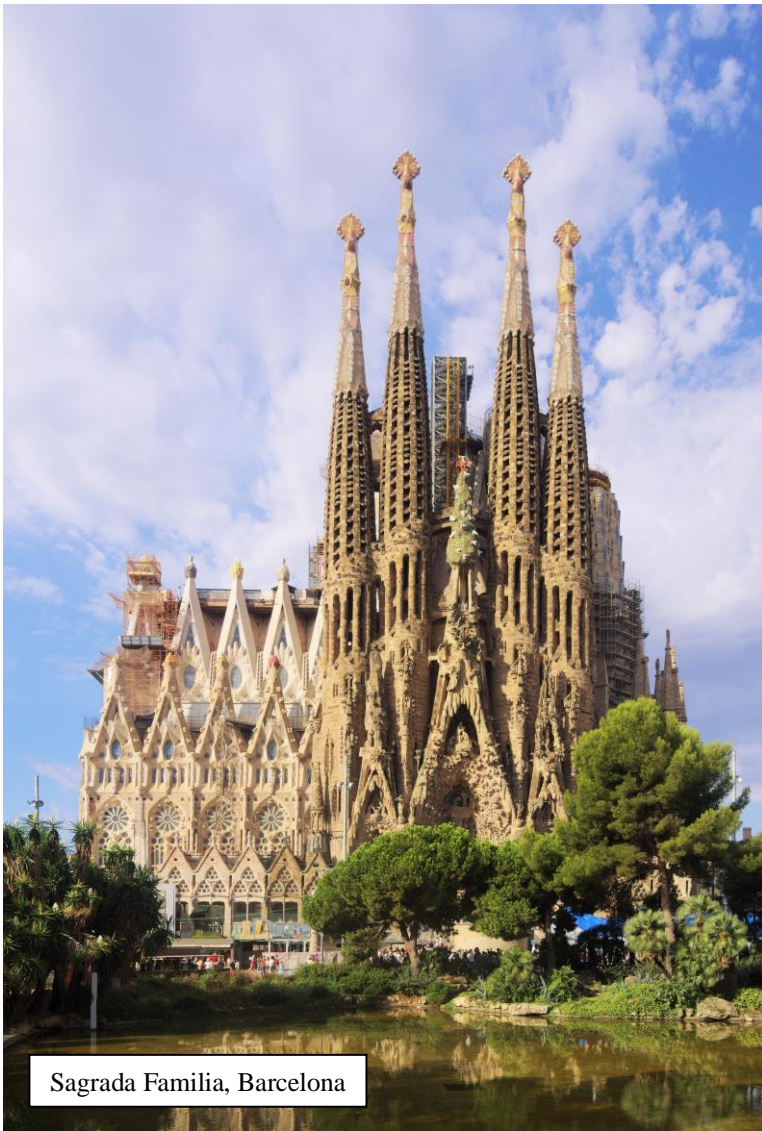
Sagrada Família, Barcelona