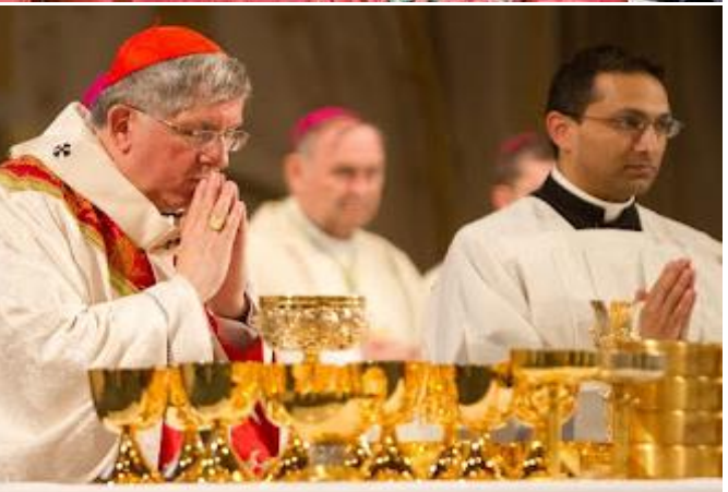
8th Day: CHARITY TO OTHERS July 4

"As the crown of her charity, there was the heroic pardon, which she granted to the man who had murdered her."