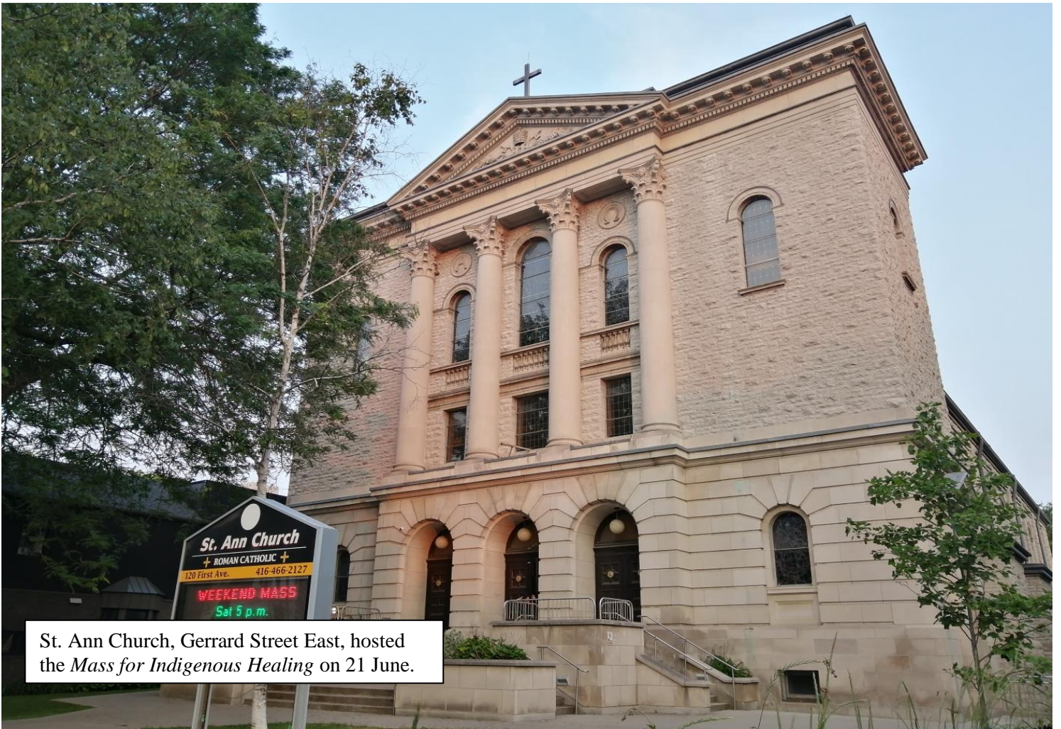
St. Ann Church, Gerrard Street East, hosted the Mass for Indigenous Healing on 21 June.