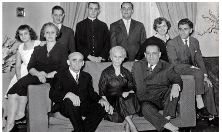
Pope Francis ( standing in back ) as Father Jorge Bergoglio , with his family in Buenos Aires, Argentina.