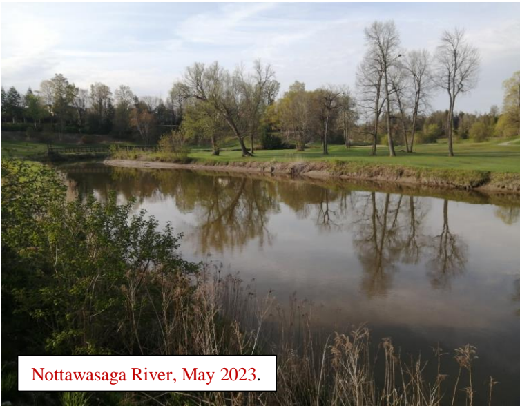
Nottawasaga River, May 2023.