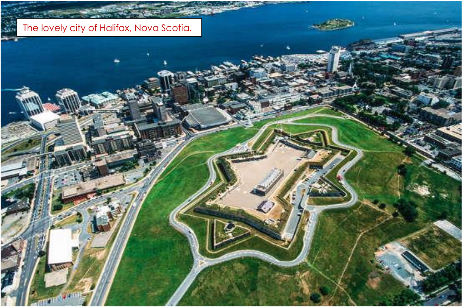
The lovely city of Halifax, Nova Scotia.