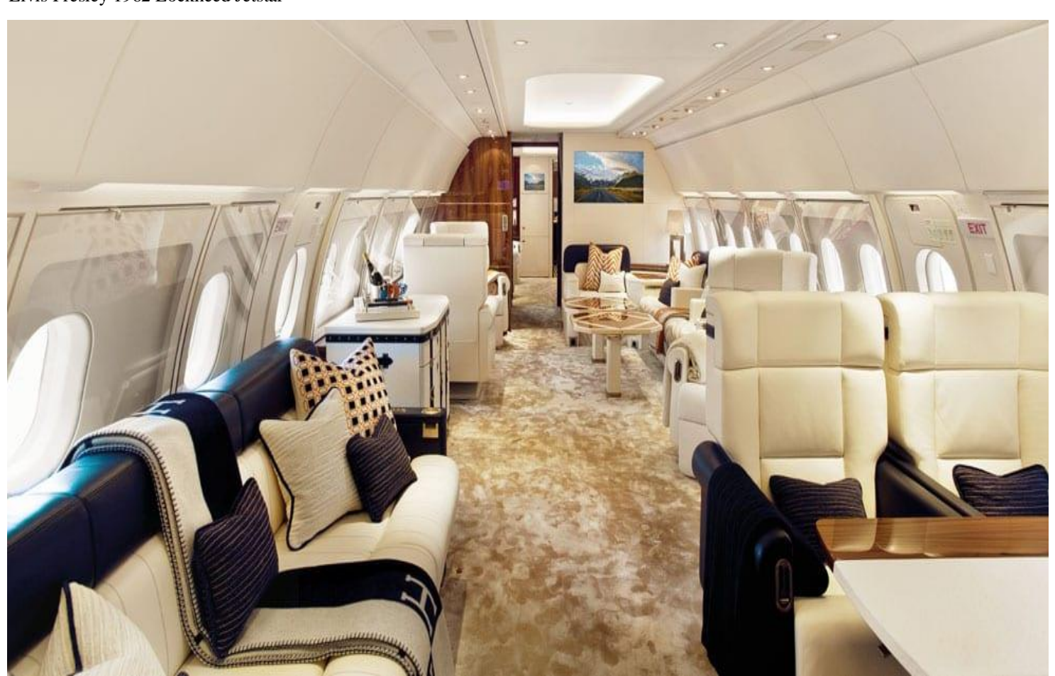
Winch Design, Mayfair interior