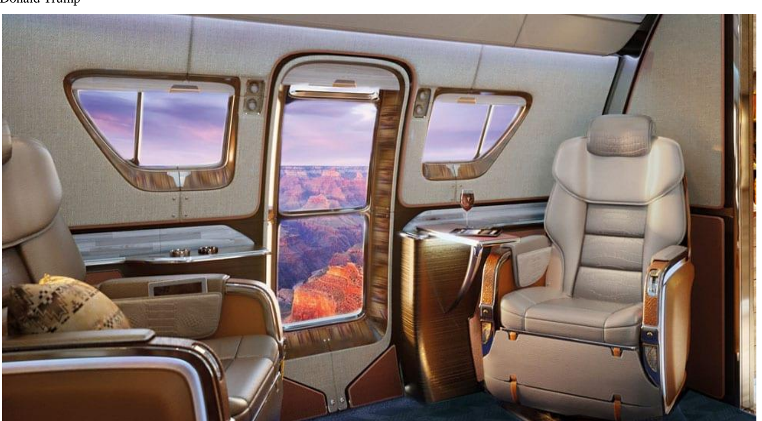
Waldorf Astoria executive jet