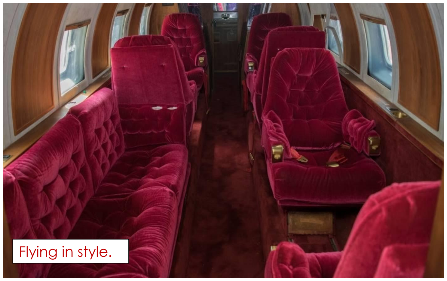
Elvis Presley 1962 Lockheed Jetstar