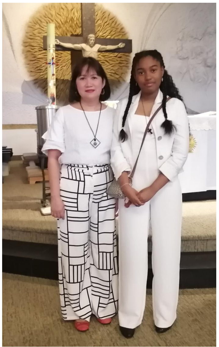
St. Maria Goretti School Confirmation, 4 May.