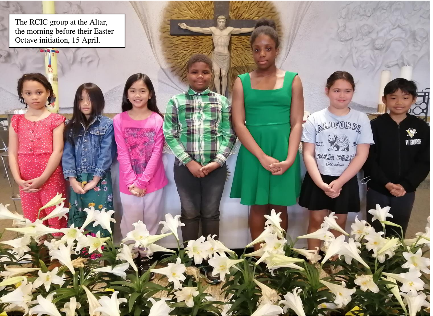
The RCIC group at the Altar, the morning before their Easter Octave initiation, 15 April.