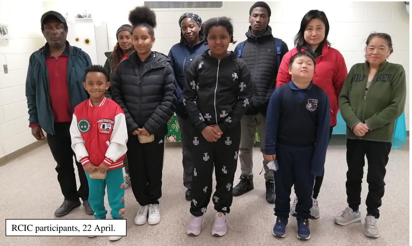
RCIC participants, 22 April.