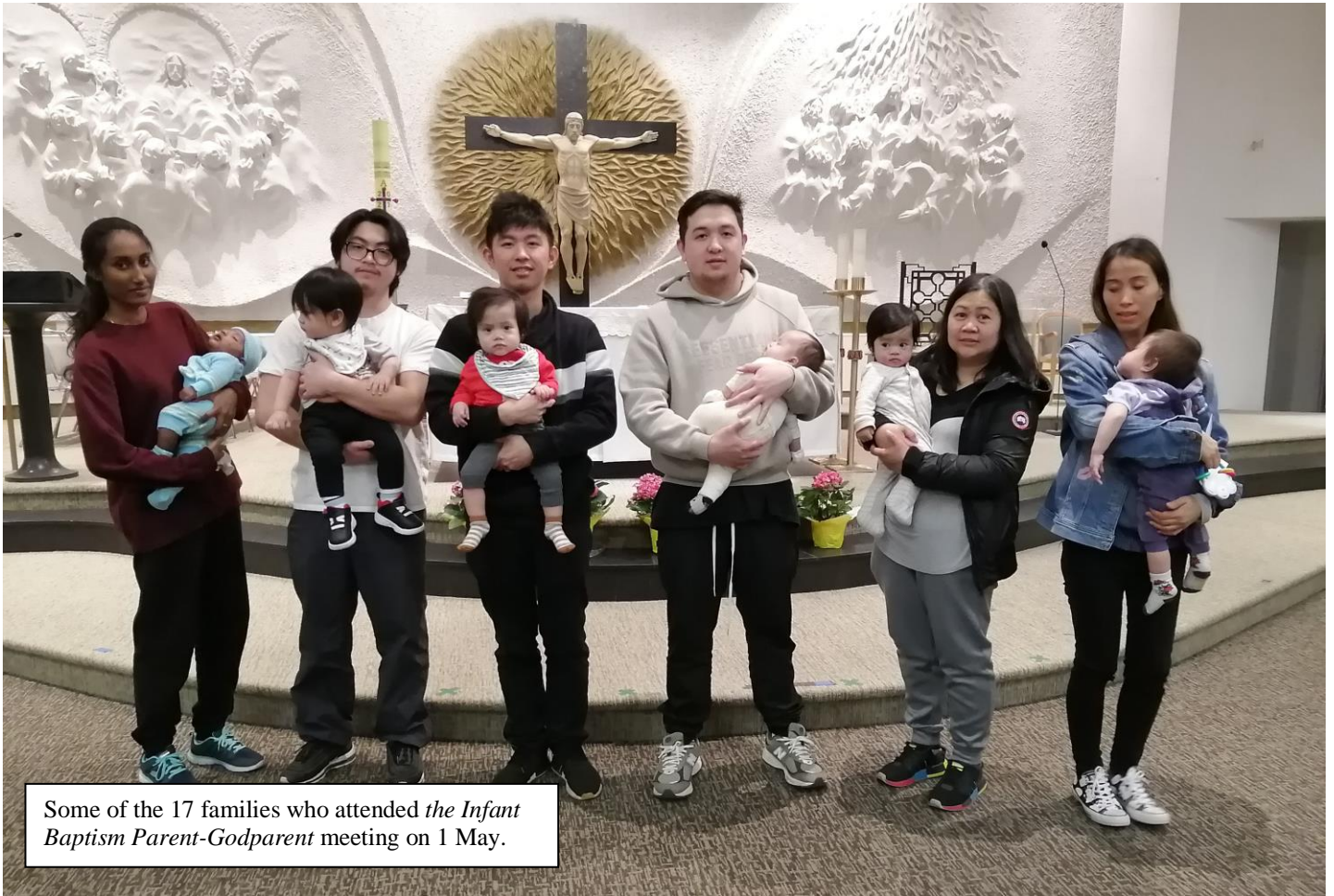
Some of the 17 families who attended the Infant Baptism Parent-Godparent meeting on 1 May.