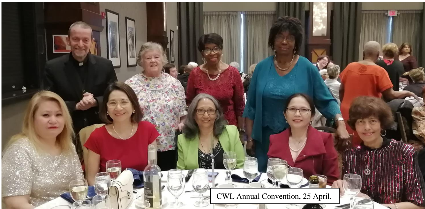
CWL Annual Convention, 25 April.