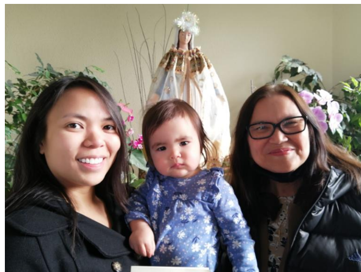
New faces in our Parish: Joining a community of faith that honours God and celebrates the holy presence of