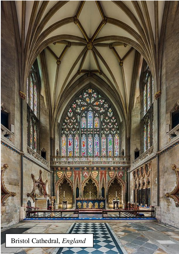
Bristol Cathedral, England