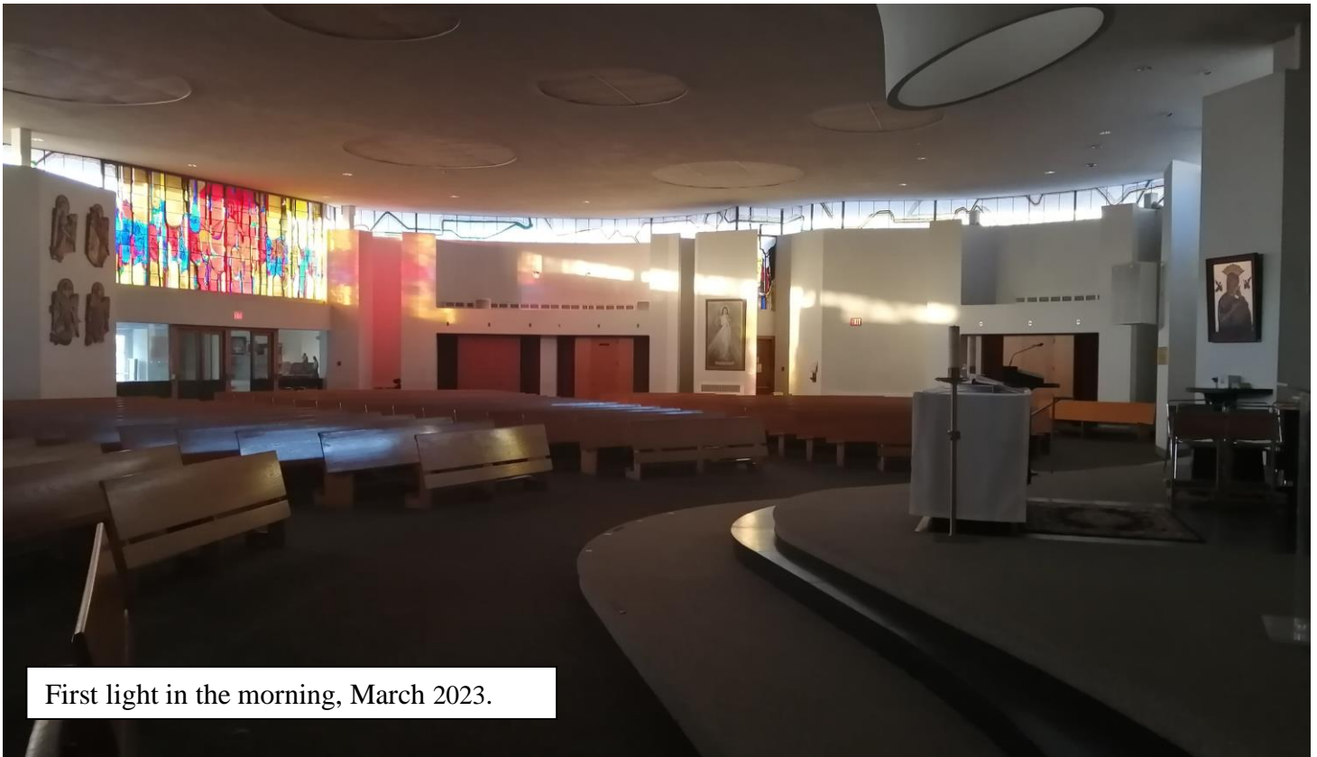
First light in the morning, March 2023.