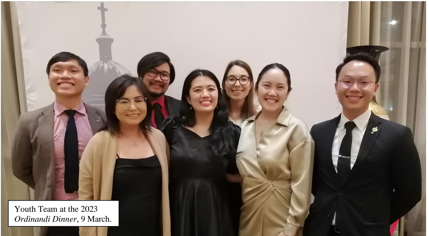
Youth Team at the 2023 Ordinandi Dinner , 9 March.