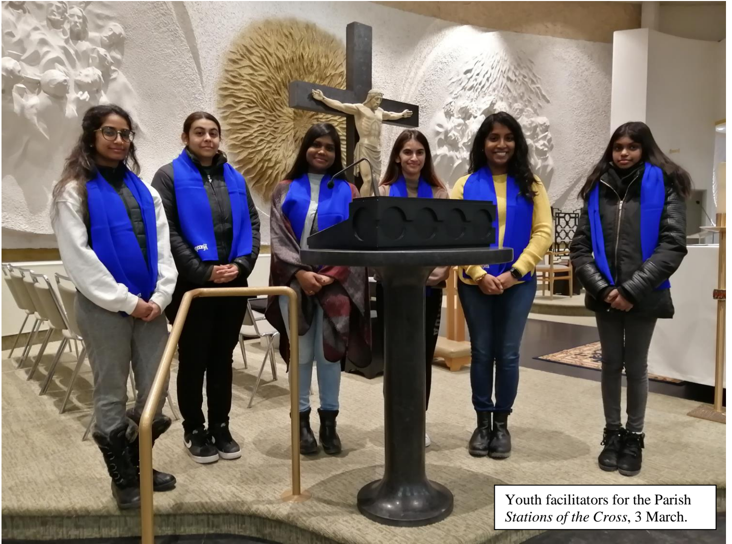
Youth facilitators for the Parish Stations of the Cross, 3 March.