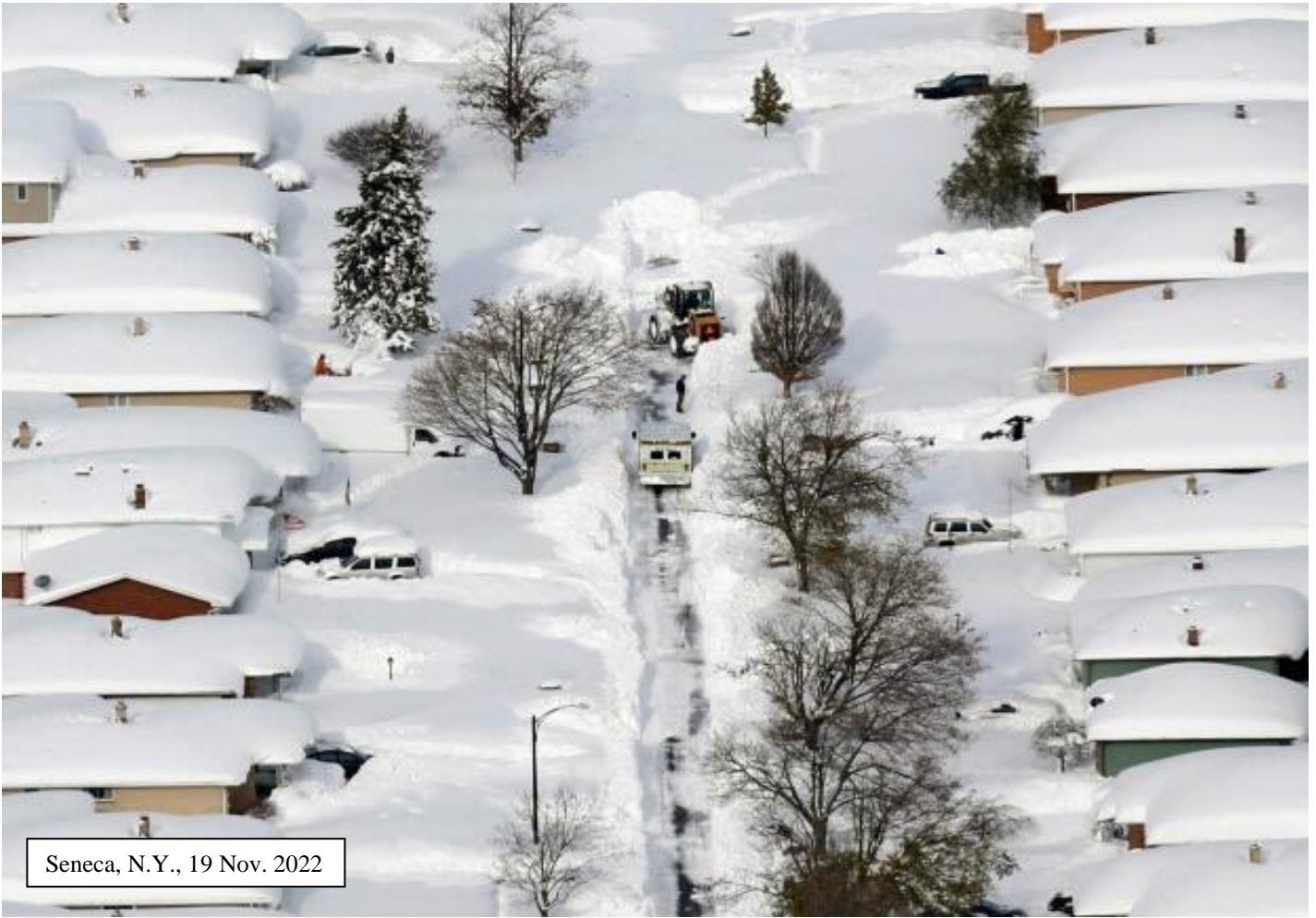
Seneca, N.Y., 19 Nov. 2022