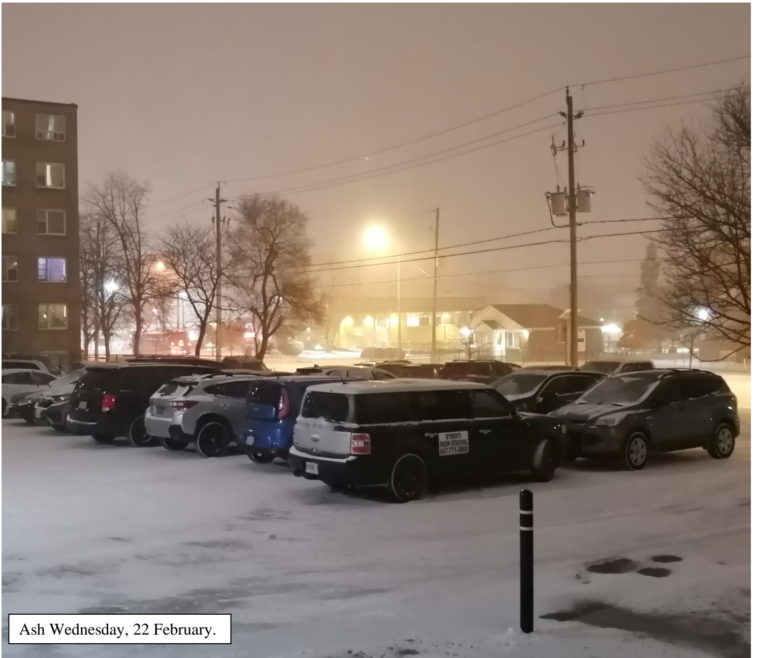
Ash Wednesday, 22 February.