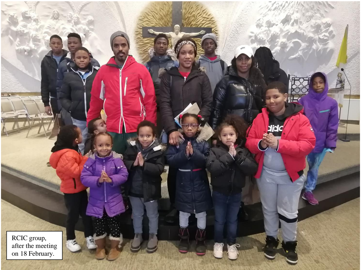
RCIC group, after the meeting on 18 February.