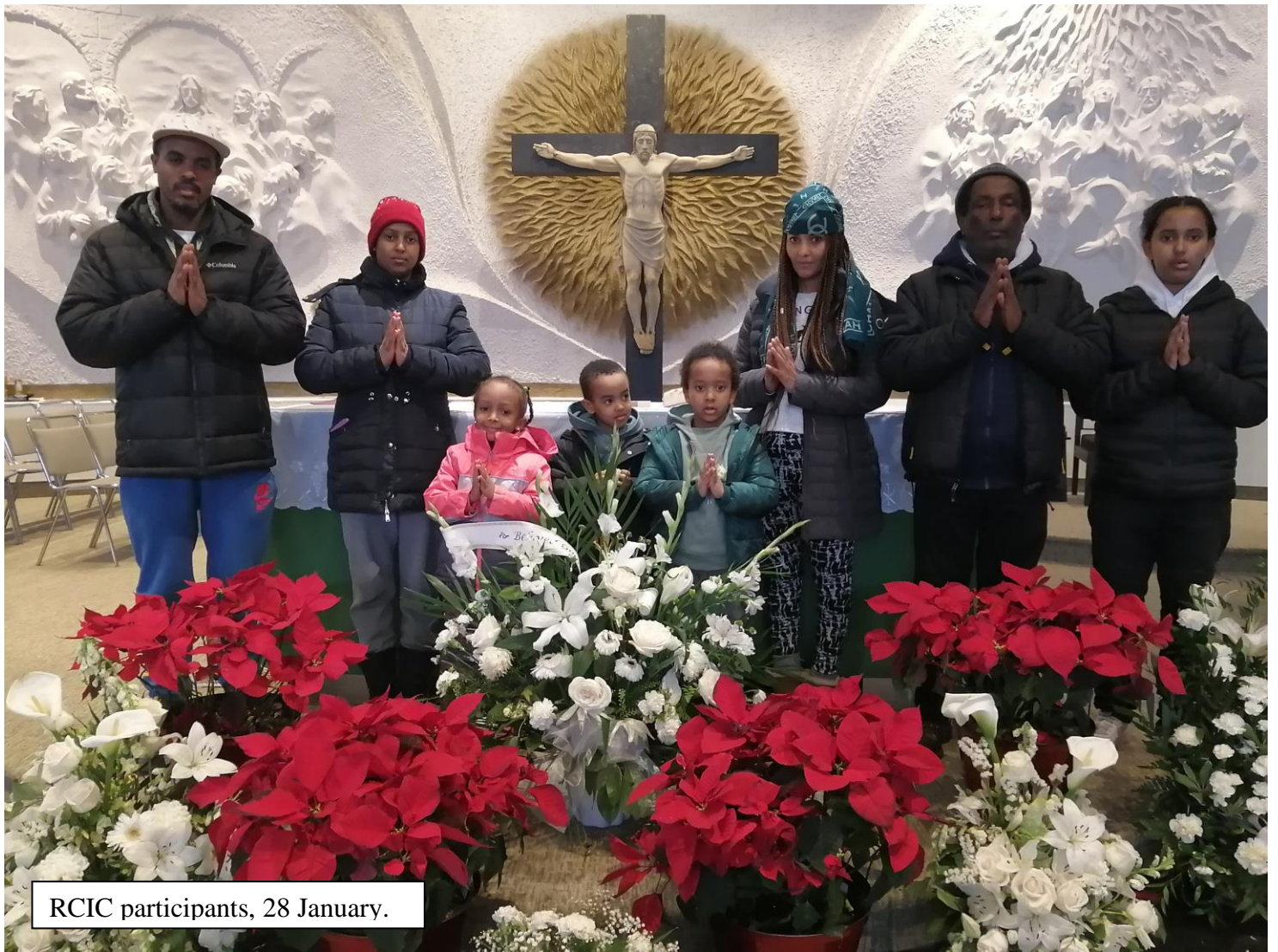
RCIC participants, 28 January.