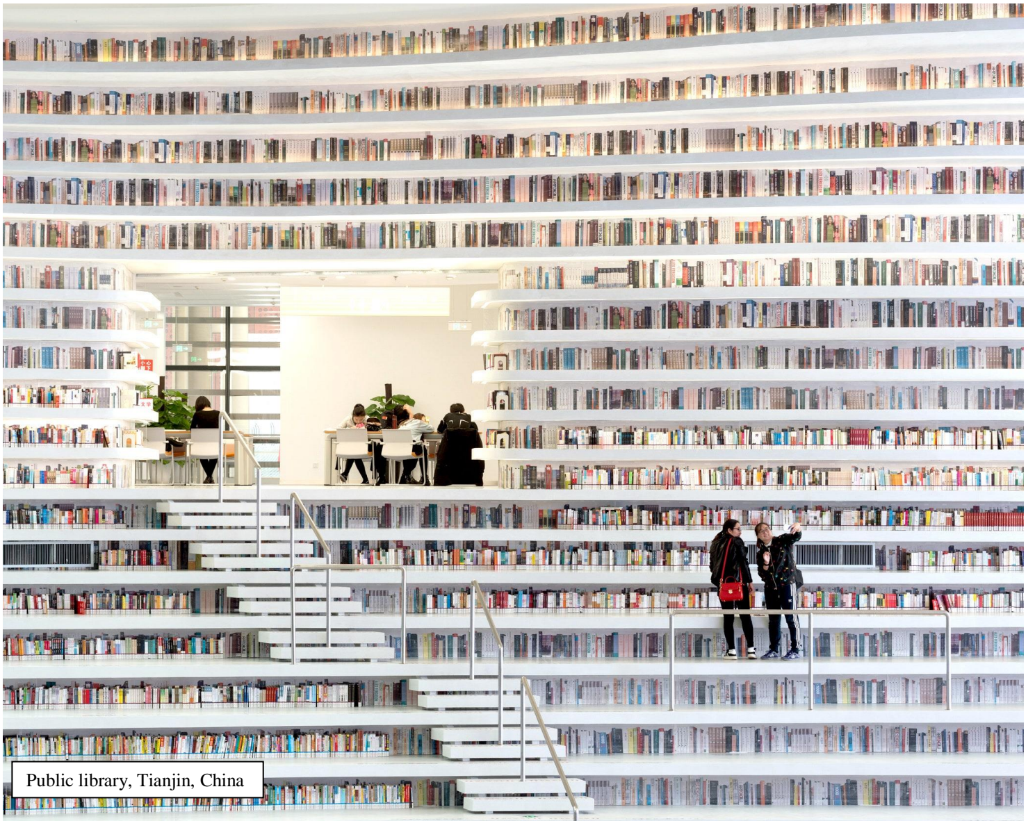
Public library, Tianjin, China