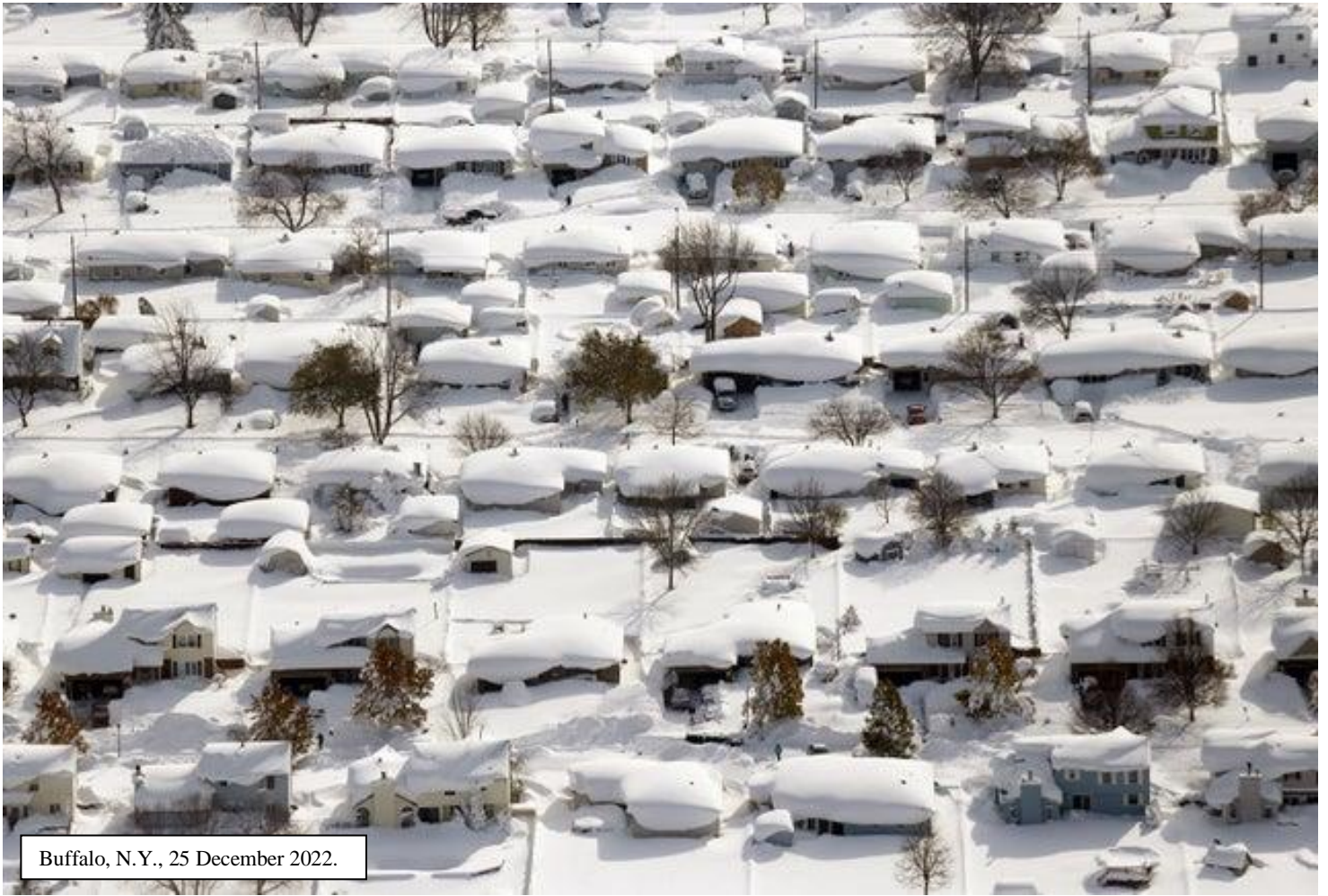
Buffalo, N.Y., 25 December 2022.