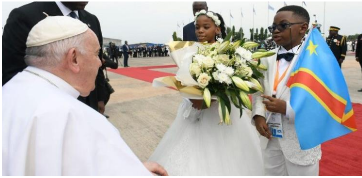
31 January 2023: Pope Francis arrives in Congo for a visit of peace until 3 February. He will then proceed to South Sudan.