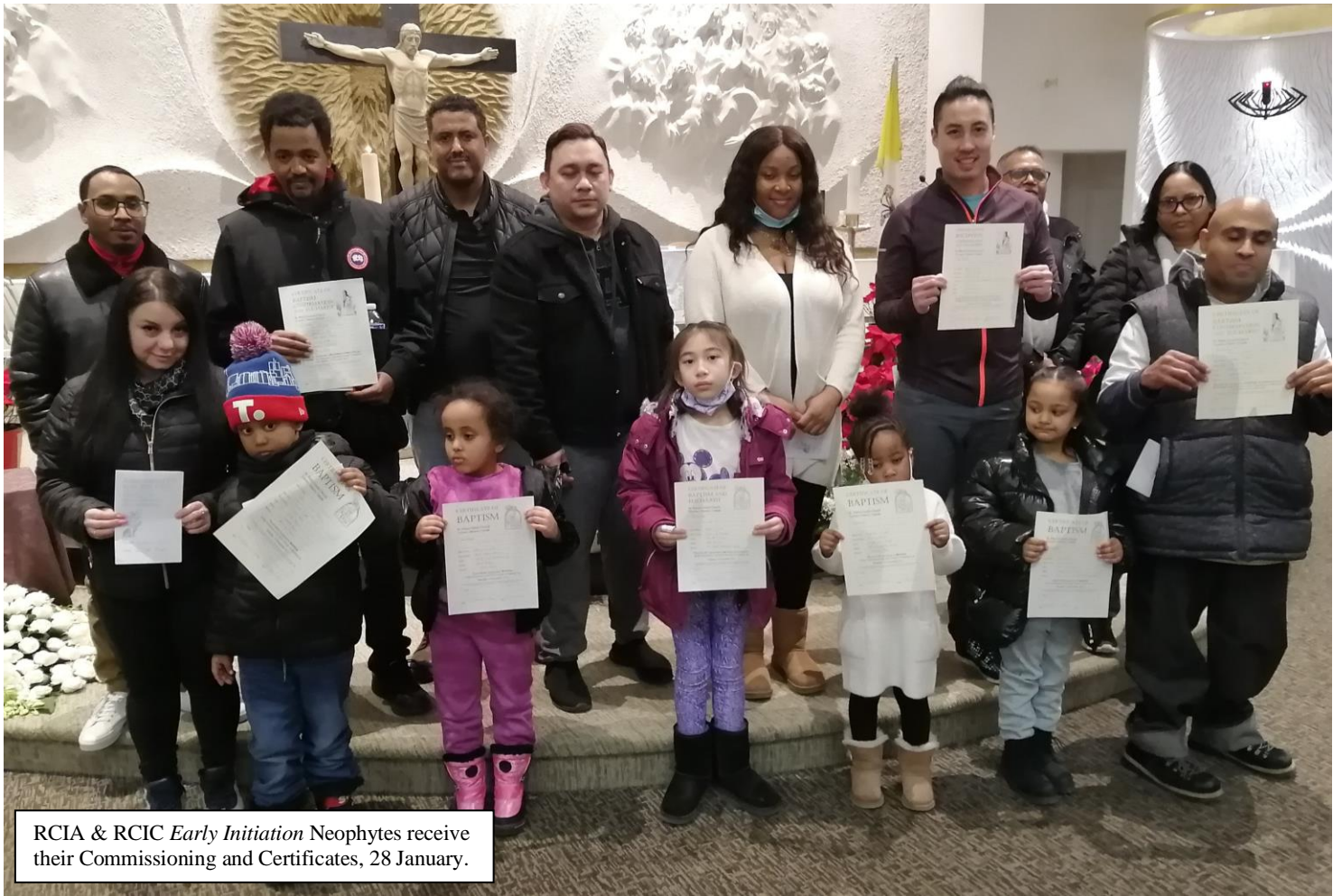
RCIA & RCIC Early Initiation Neophytes receive their Commissioning and Certificates, 28 January.