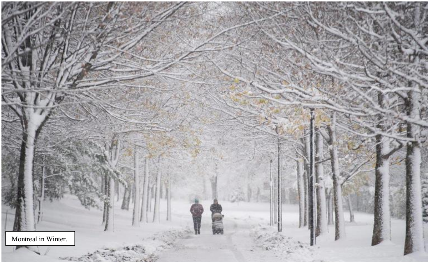
Montreal in Winter.