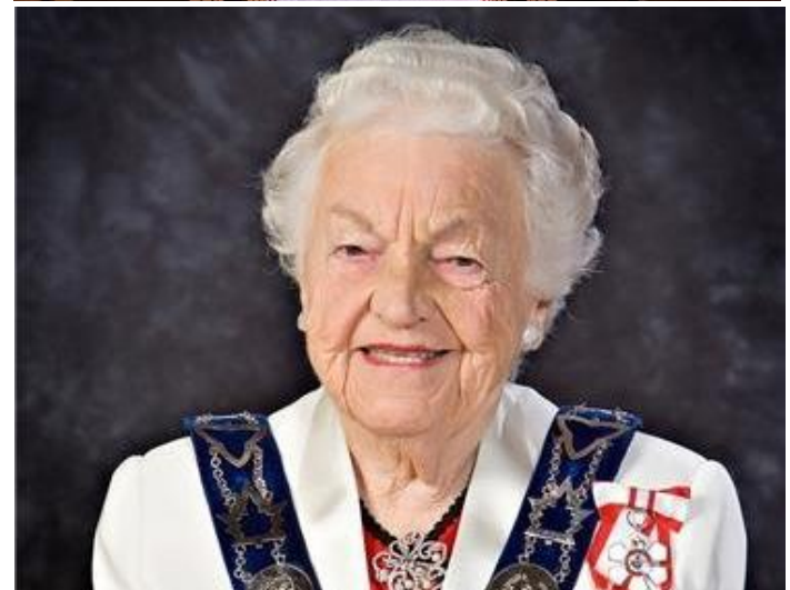
Hazel (Journeaux) McCallion; Born 14 February 1921, Gaspé, Quebec; died 29 January 2023.

“Through the prayers of St. Blaise, may God free you from ailments of the throat and from every other evil. In the name of the Father, and of the Son, and of the Holy Spirit. Amen.”