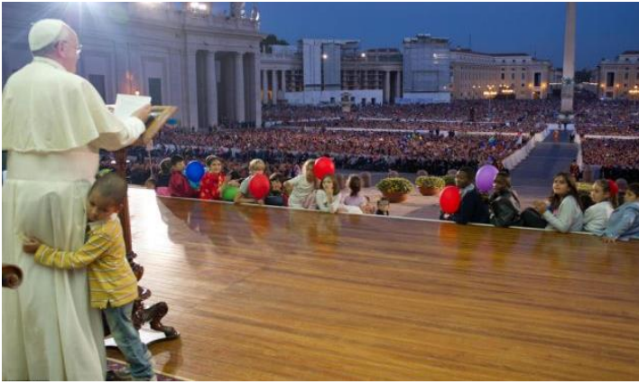
26 Oct. 2013: Pope Francis is hugged by a boy at a Family Day gathering at the Vatican. He is a Colombian orphan, adopted by an Italian family.