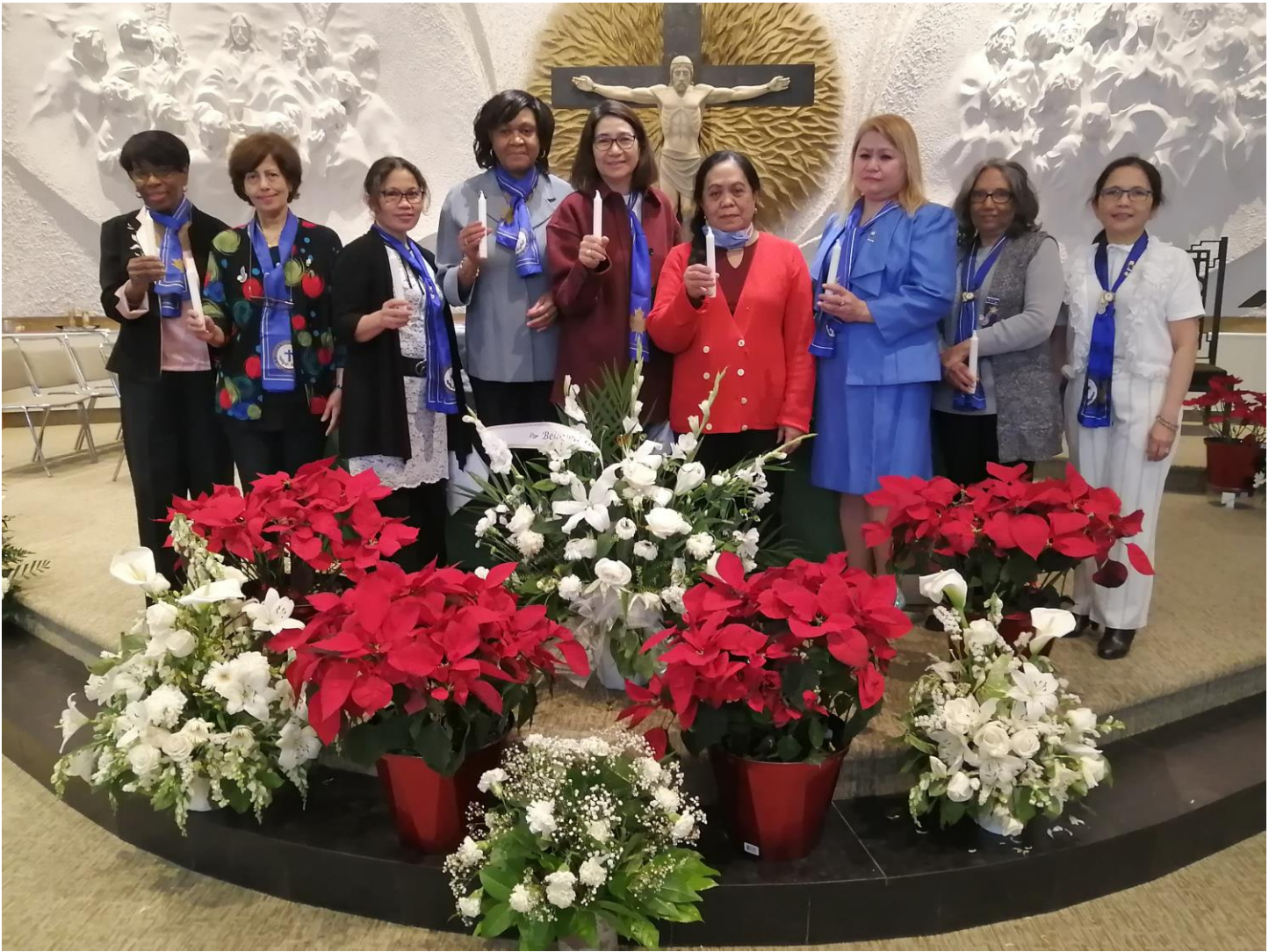
Top: The newly-installed Catholic Women's League Executive , 29 January.