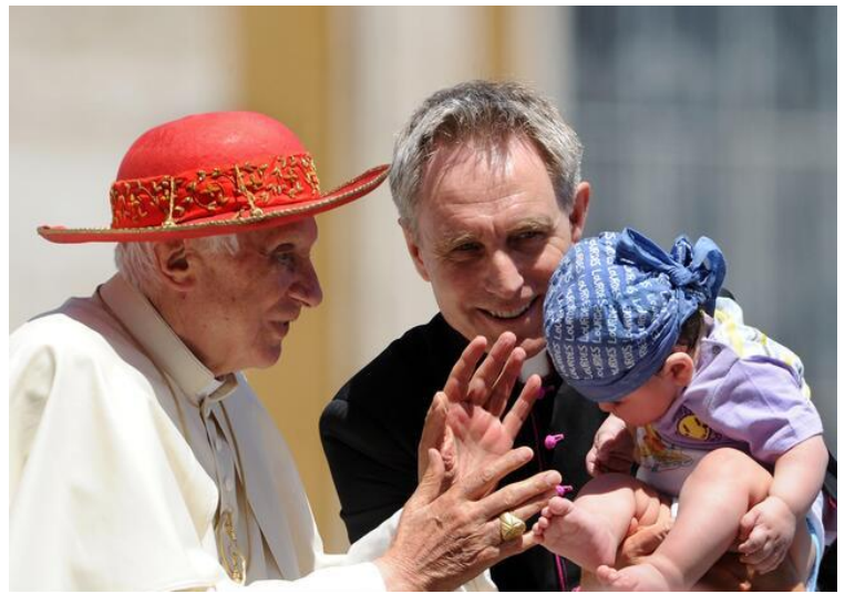
Funeral Mass for Pope Emeritus Benedict XVI , 5 January 2023.