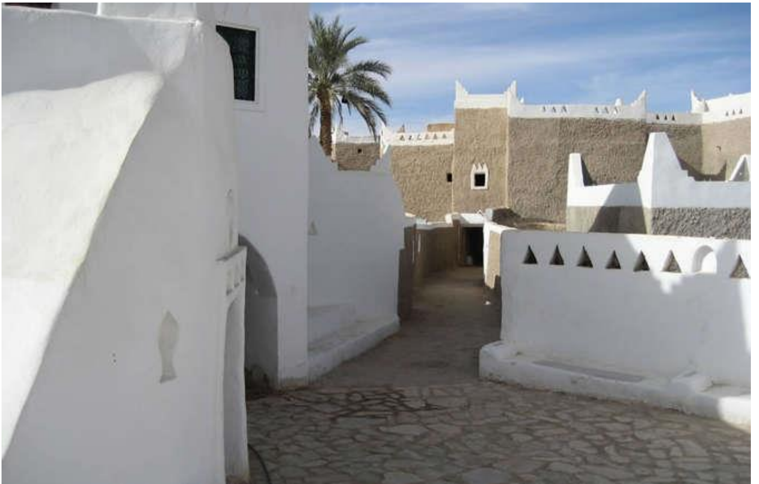
Lagos, Nigeria; Gademes, Libya