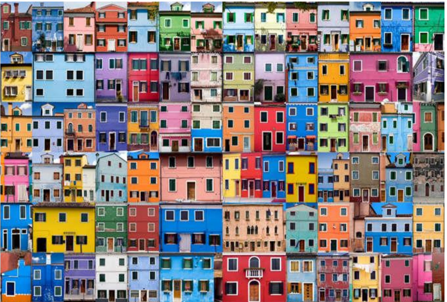
Ittoqqortoormiit, Greenland; Porto, Portugal